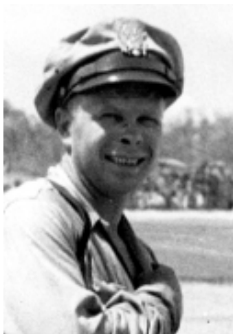
Maj. Richard Bong (40)

Ranks are as of last victory in World War II.