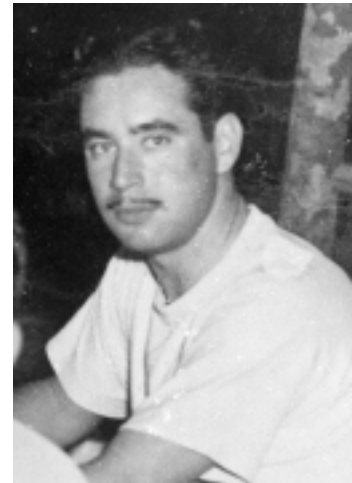
Lt. Col. Boyd Wagner (8)