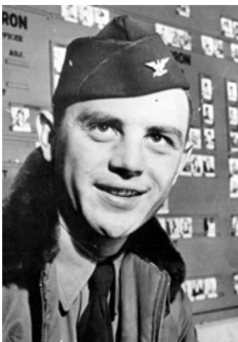
Col. Hubert Zemke (17.75)