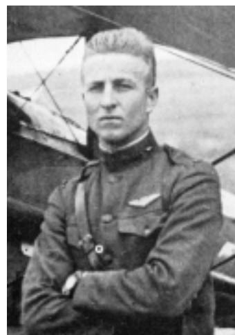
2nd Lt. Frank Luke Jr. (18)