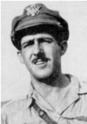
Maj. Thomas McGuire Jr. (38)