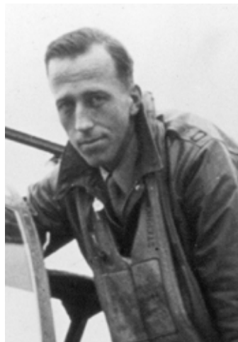
Col. James Howard (7)