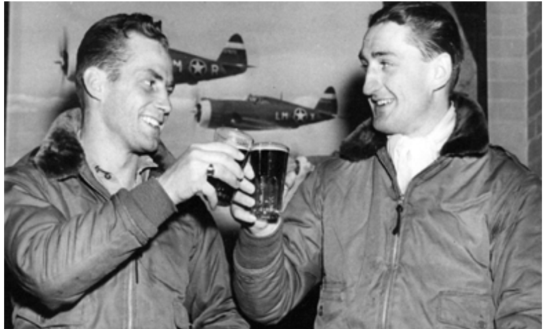
Capt. Robert Johnson (27) and Lt. Col. Francis Gabreski (28)