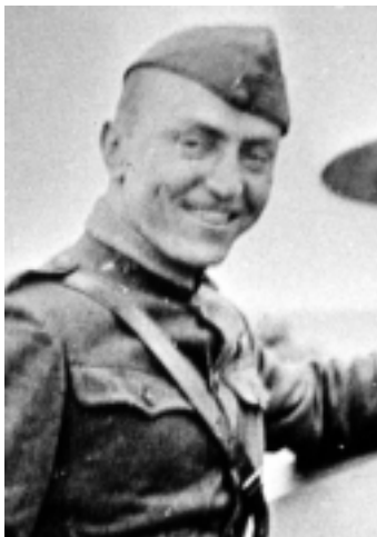
Capt. Eddie Rickenbacker (26)