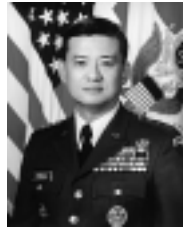
Army Chief of Staff Gen. Eric K. Shinseki