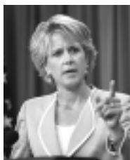
ASD, Public Affairs Victoria Clarke