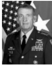
US Central Command Gen. Tommy R. Franks, USA