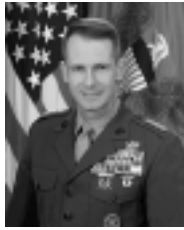
Vice Chairman Gen. Peter Pace, USMC