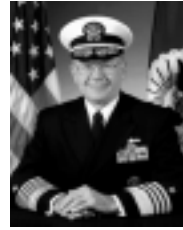
Chief of Naval Operations Adm. Vern Clark