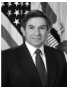
Deputy Secretary of Defense Paul D. Wolfowitz