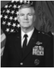
Chairman Gen. Richard B. Myers, USAF