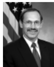
USD, Comptroller & Chief Financial Officer Dov S. Zakheim