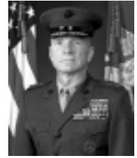
Commandant of the Marine Corps Gen. Michael W. Hagee