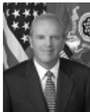
Secretary of the Army Thomas E. White

Undersecretary of the Air Force Peter B. Teets