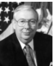
Secretary of the Air Force James G. Roche

Undersecretary of the Air Force Peter B. Teets