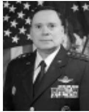
Air Force Chief of Staff Gen. John P. Jumper