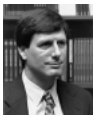
Director, Program Analysis & Evaluation Stephen A. Cambone*