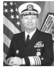
US Joint Forces Command Adm. E.P. Giambastiani Jr., USN