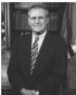
Secretary of Defense Donald H. Rumsfeld