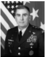
Director, Joint Staff Lt. Gen. John P. Abizaid, USA