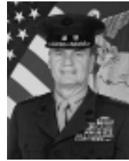
US European Command Gen. James L. Jones Jr., USMC