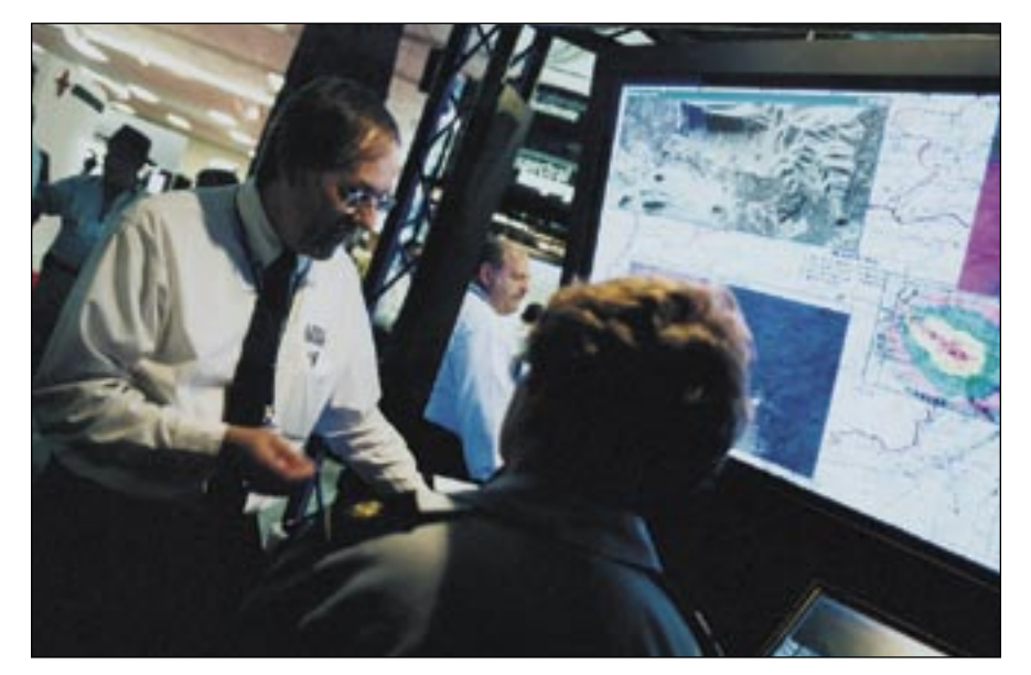
At left, a representative from the Air Force Research Laboratory describes technologies with applications in directed energy, munitions, and sensors. The AFRL booth featured dramatic visualizations of future technology, including models of conceptual aircraft.