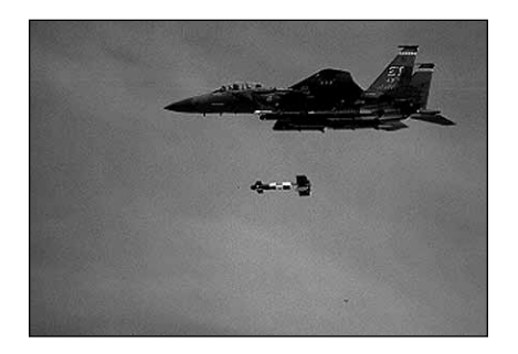
The chase aircraft reports that, after two preliminary passes, everything looks good. Keeping close watch on speed and altitude, the F-15E aircrew makes the drop (left).