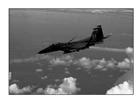
Fitted with the same kind of load it would have on a combat mission, the F-15E also carries a telemetry pod to record data while the bomb is in flight. Not every weapon tested gets the loud paint job, but, in this case, the bright markings on the munition help cameras and observers track it and will help those reviewing the test footage.

In each test flight, a finely scripted "dance card" provides the precise agenda. More a checklist than a card, the script details timing, coordinates, and altitudes that must be attained to properly measure the system being evaluated. A chase F-16 gives the F-15E test subject a good once-over to make certain all is where it should be.