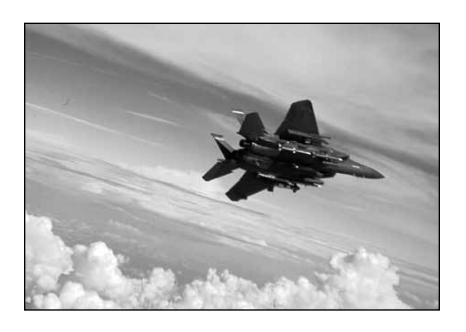
The crews, engineers, and technicians at the 46th Test Wing are determined that anything they test comes to the force with no hidden surprises or operational shortcomings, to work reliably and "as advertised."

The first two lots of GPS-aided GBU-15s have entered the inventory and have been deployed overseas.