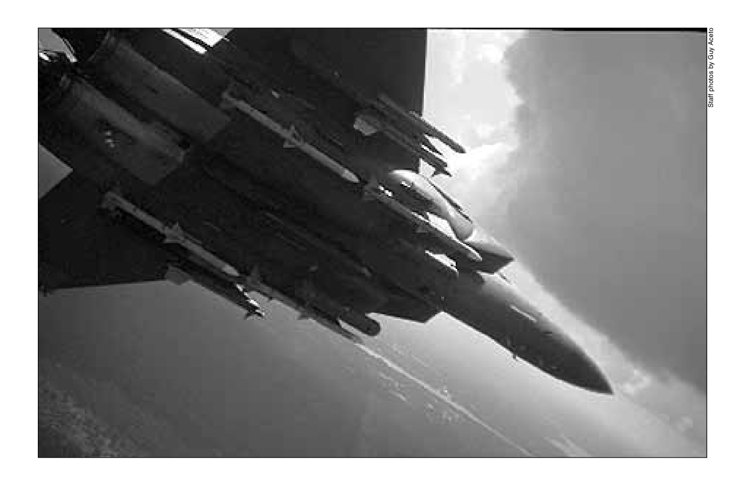
After releasing the weapon, the F-15E heads back to base. At right, high-speed cameras freeze the moment of payoff: right-on-target delivery of 2,000 pounds of high explosive. The GPS unit can guide the bomb to this pinpoint impact without the aircrew's active intervention.