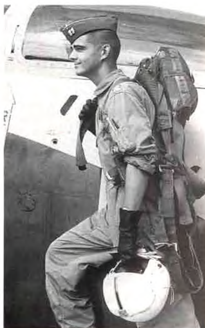
In 1967, Capt. Michael J. Dugan was an A-1E pilot with the 1st Air Commando Squadron, flying out of Pleiku. He went on to become Air Force Chief of Staff. General Dugan, USAF (Ret.), is an AFA national director and a member of the Association's Executive Committee. He lives in Hastings-on-Hudson, N. Y.