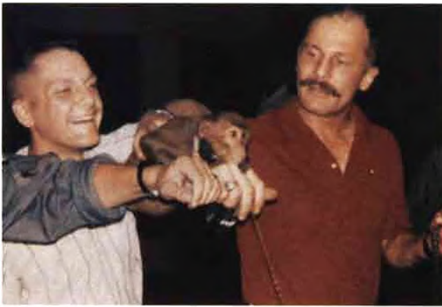
Col. Robin Olds (right), leader of the 8th Tactical Fighter Wing "Wolfpack," master of the "MiG Sweep" that downed seven North Vietnamese aircraft in a single day, and the only USAF ace with victories in World War II (thirteen) and in the Vietnam War (four), relaxes with his colleagues and a monkey at Ubon. Brigadier General Olds, USAF (Ret.), lives in Steamboat Springs, Colo.