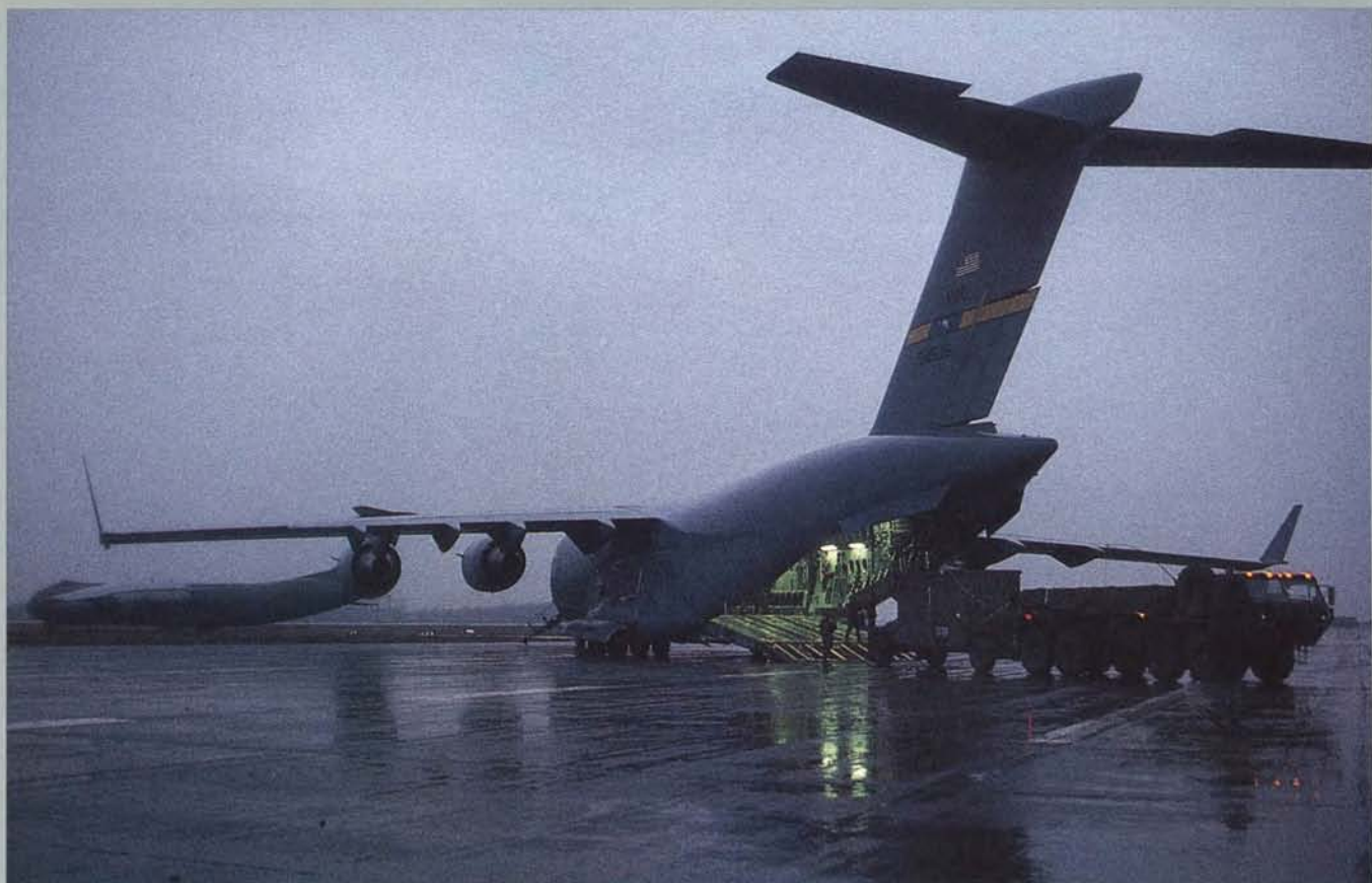
The typically foul Balkan winter hampered airlift at the start of the operation, and some of the first troops had to arrive by truck or bus. The weather cleared, and airlift operations started with a rush. Air Mobility Command C-17s (above right) and C-141s (above left) brought in the thousands of tons of equipment necessary for the operation.