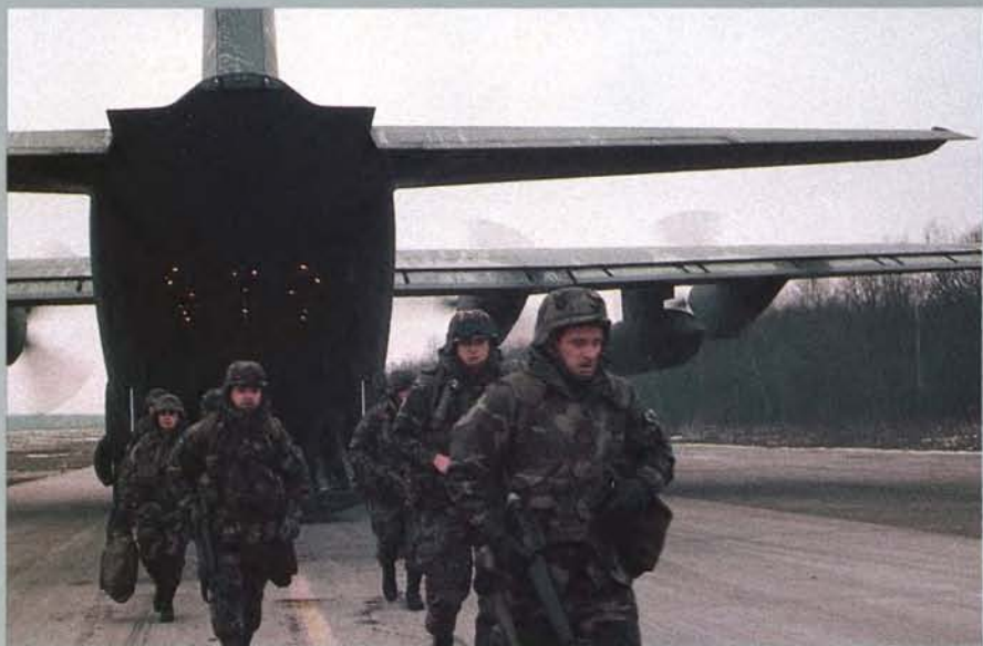
Joint Endeavor also employed C-130s (and KC-10s, KC-135s, and Civil Reserve Air Fleet aircraft) to bring in troops and cargo. This C-130 has just landed at Tuzla, Bosnia.