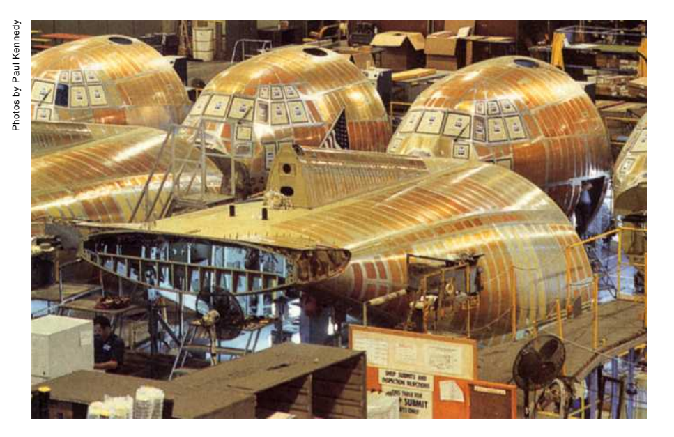
Feeder plants in Clarksburg, W. Va., and Meridian, Miss., produce some of the C-130J's components, such as the cargo bay floor, and subcontractors fabricate some parts, but most of the actual assembly takes place in the cavernous Plant Six. At left, a row of nose subassemblies faces a row of tail subassemblies. One of each will eventually be part of the same C-130, separated by about 100 feet of aircraft.

A single person on the shop floor can operate one of the huge fiveton- or ten-ton-capacity cranes suspended from the plant's ceiling, and it will take only two people like crane operator Mike Longano and mechanic Cherie Jones—to move a 2,000-pound vertical stabilizer into position on the tail assembly. Once it is in position, two more mechanics will install it, and another pair will finish the job. While awaiting this installation, the huge vertical pieces must always be stored in an east-west direction so the wind won't knock them over when the hangar doors at each end of the building are opened.