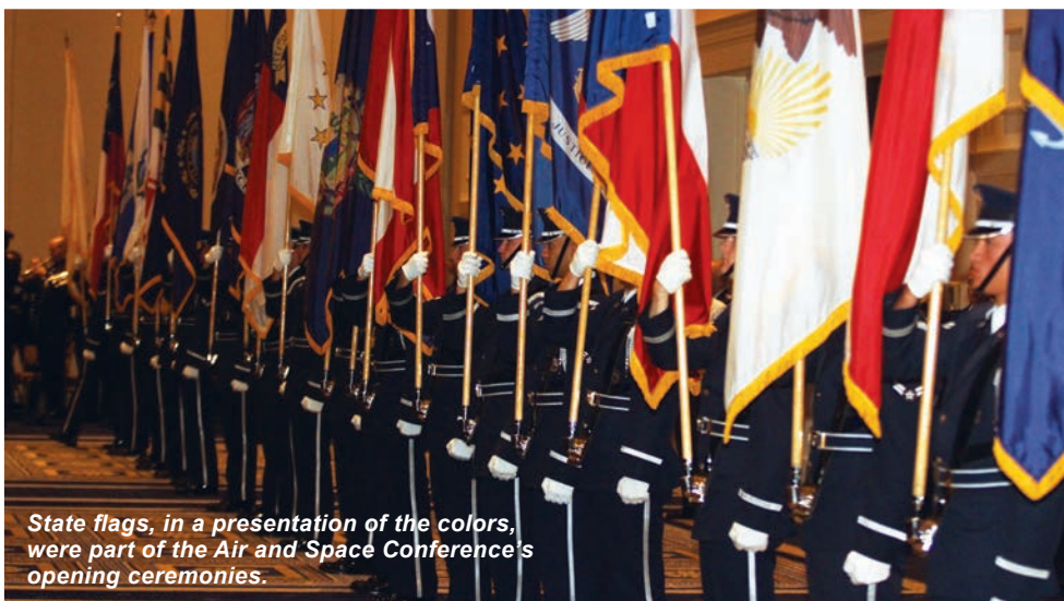
State flags, in a presentation of the colors, were part of the Air and Space Conference's opening ceremonies.