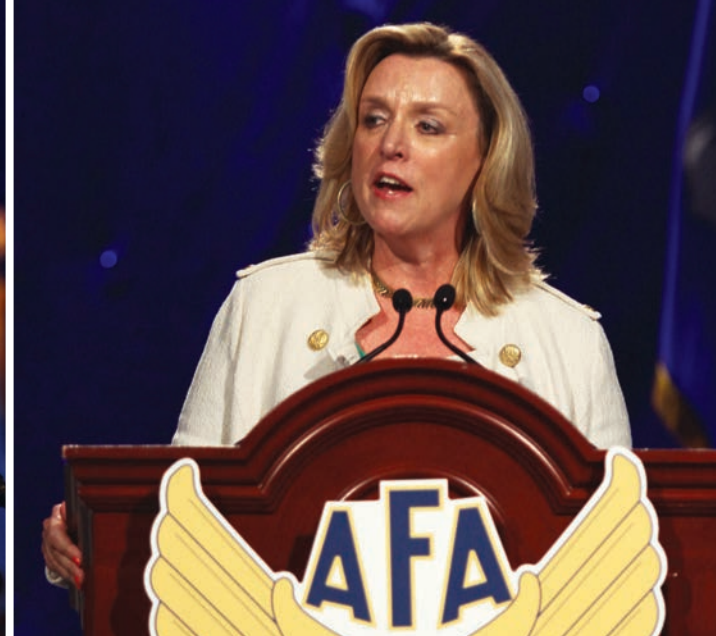
USAF Chief of Staff Gen. Mark Welsh (l) and Air Force Secretary Deborah Lee James (r) were key speakers at AFA's Air & Space Conference.