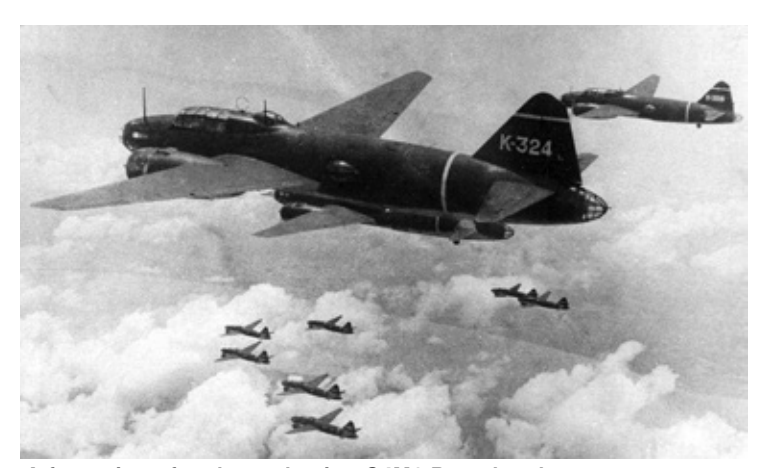
A formation of early production G4M1 Betty bombers.

Nicknamed "Hamaki," or "Flying Cigar" ★ carried Japanese Fleet Adm. Isoroku Yamamoto on fatal mission (shot down by USAAF in 1943) ★ produced in numbers greater than any Japanese bomber ★ flown in combat from Aleutians in north to Australia in south ★ served as basis for 30 heavily armed G6M "escort fighters" ★ suffered 182 losses (of fleet of 240) in first 90 days of war with US ★ relied on rubber sheets on wing outer surfaces as fuel tank protection ★ transported Japanese surrender-planning team to le Shima on Aug. 19, 1945 ★ operated by Indonesian air force after World War II.