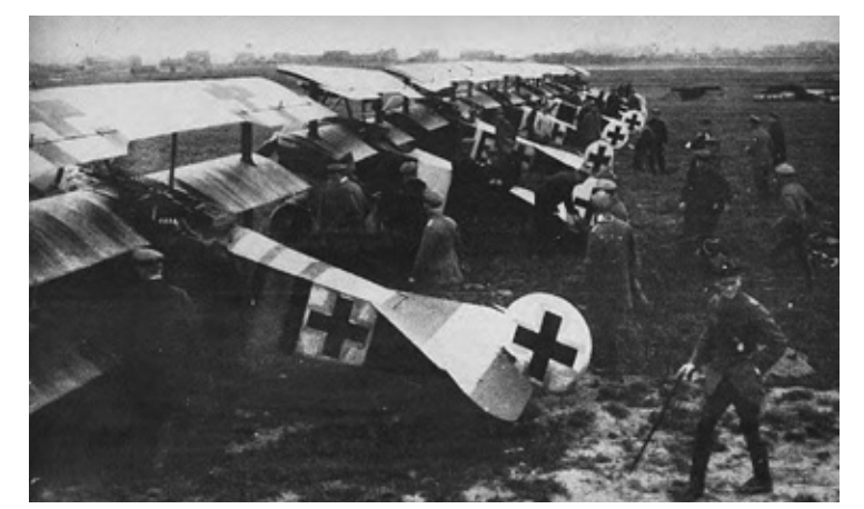
Triplanes of Jasta 26 at Erchin, France, during World War I.

Designed, built by Fokker Flugzeugwerke ★ first flight July 5, 1917 ★ crew of one ★ number built 320 ★ one Le Rhone/ Oberursel Ur.II 9-cylinder rotary engine ★ armament two 7.92 mm Spandau LMG 08 front-mounted machine guns with 1,000 rounds of ammunition ★ max speed 115 mph ★ range 185 miles ★ weight (loaded) 1,292 lb ★ span (top wing) 23 ft 7 in ★ length 18 ft 11 in ★ height 9 ft 8 in.