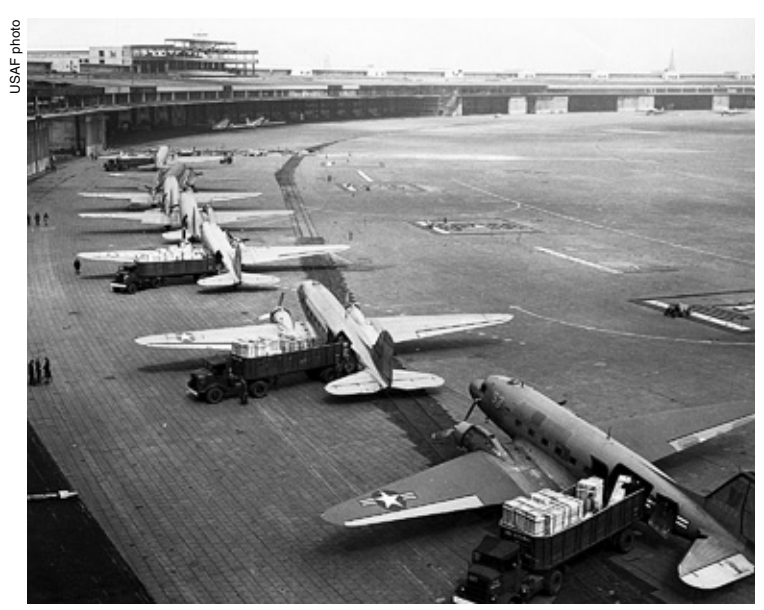
Air Force C-47 and Navy Douglas R4D aircraft unload at Tempelhof Airport during the Berlin Airlift.