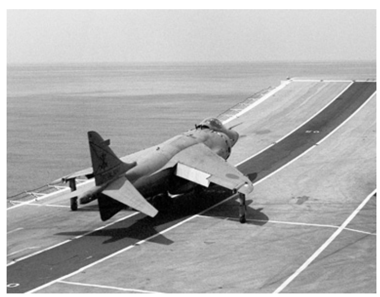
A Sea Harrier uses a ski-jump bump while taking off from HMS Invincible.