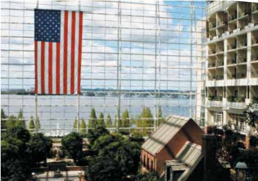
Left: A glass-walled atrium at the Gaylord National Hotel and Convention Center offered dramatic views of the Potomac River. Bottom: A sea of airmen, members of the press, and conference attendees flood into the Air & Space Technology Exposition.