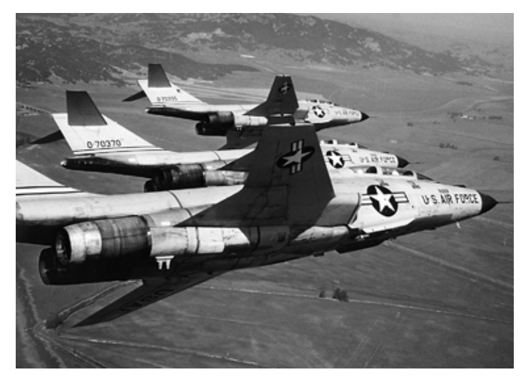
A flight of F-101B Voodoo interceptors.