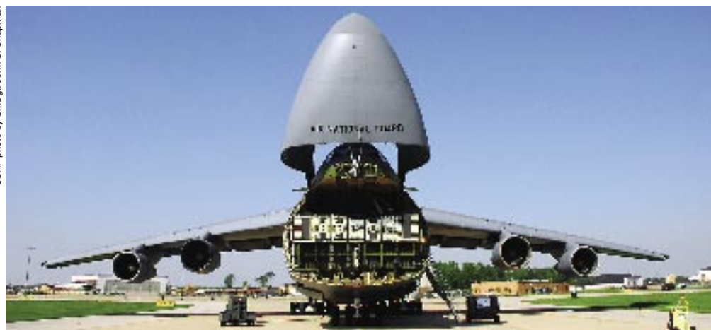
A C-5 from Stewart ANGB, N.Y., takes on cargo on the flight line at Hulman Arpt., Ind., during an exercise.