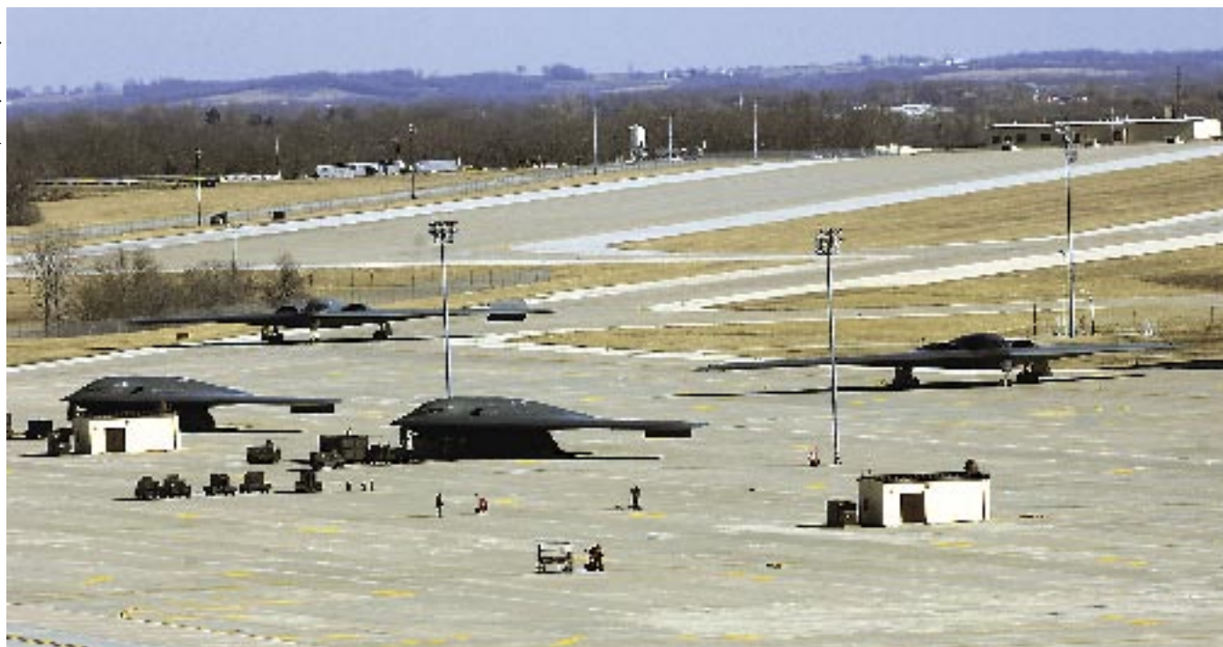
At Whiteman AFB, Mo., two B-2s taxi past another pair of Spirits.