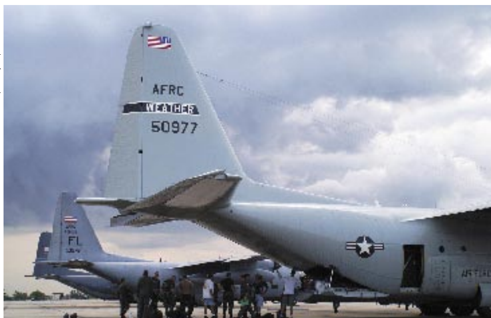
920th Rescue Wing crews and support personnel at Patrick AFB, Fla., load supplies onto an HC-130P/N.