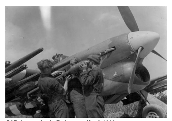
RAF airmen reload a Typhoon on May 3, 1944.