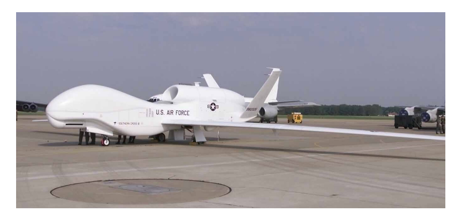
RQ-4 Global Hawk

Global Hawk began as an advanced concept tech-nology demonstrator, completed a military utility assessment, and in March 2001 entered into EMD. It has