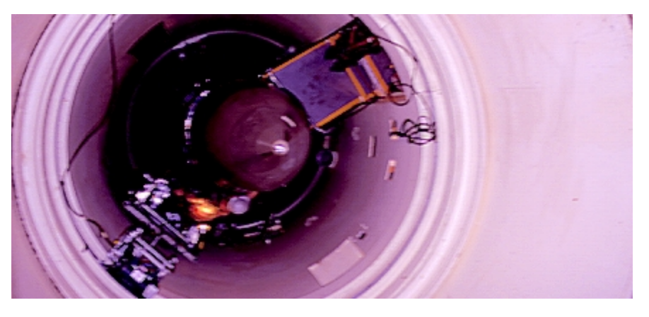
LGM-30G Minuteman III in its silo (Guy Aceto)

Brief: A supersonic, short-range, IR-guided air-to-