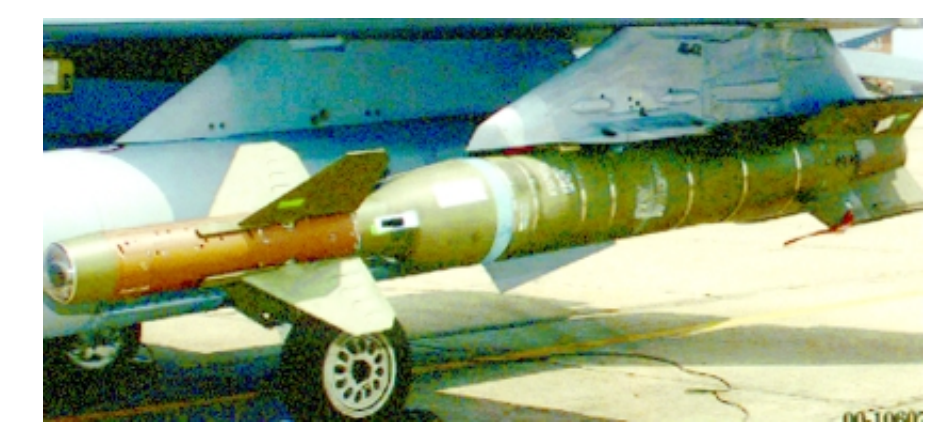
GBU-31 Joint Direct Attack Munition