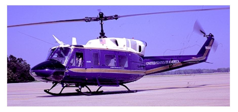
UH-1N Iroquois (Guy Aceto)