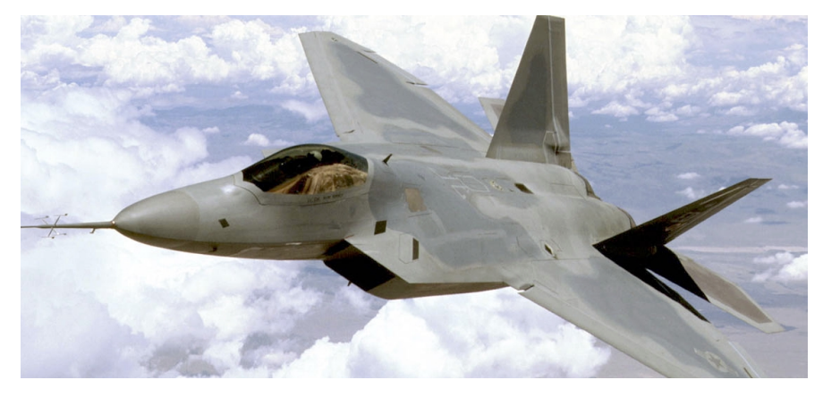
F-22 Raptor

Brief: High-technology follow-on for the F-15C. An all-weather fighter that combines an extremely maneuverable airframe at both sub- and supersonic speeds with stealth technologies and highly integrated avion-