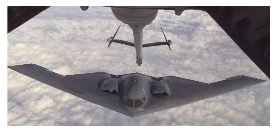
B-2 Spirit being refueled by a KC-10A Extender

August 1958, with the first of 193 aircraft entering service in February 1959. Withdrawn 1994. B-52H. The only version still in service, the H intro-