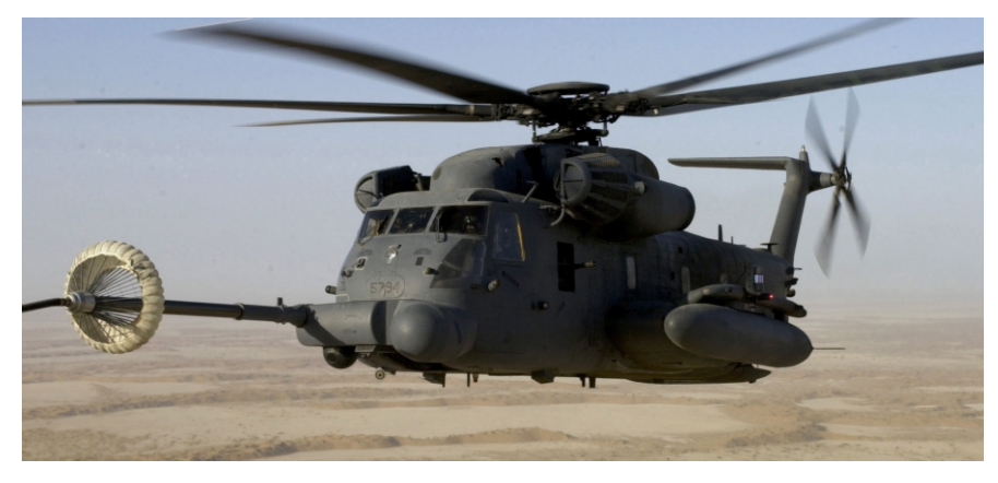
MH-53J Pave Low III

Further modifications include an automatic flight-con-trol system, NVG lighting, FLIR, color weather radar, engine/rotor blade anti-ice system, retractable in-flight refueling probe, internal auxiliary fuel tanks, and an integral rescue hoist. Combat enhancements include RWR, IR jammer, flare and chaff countermeasures dispensing system, and two 7.62 mm machine guns.