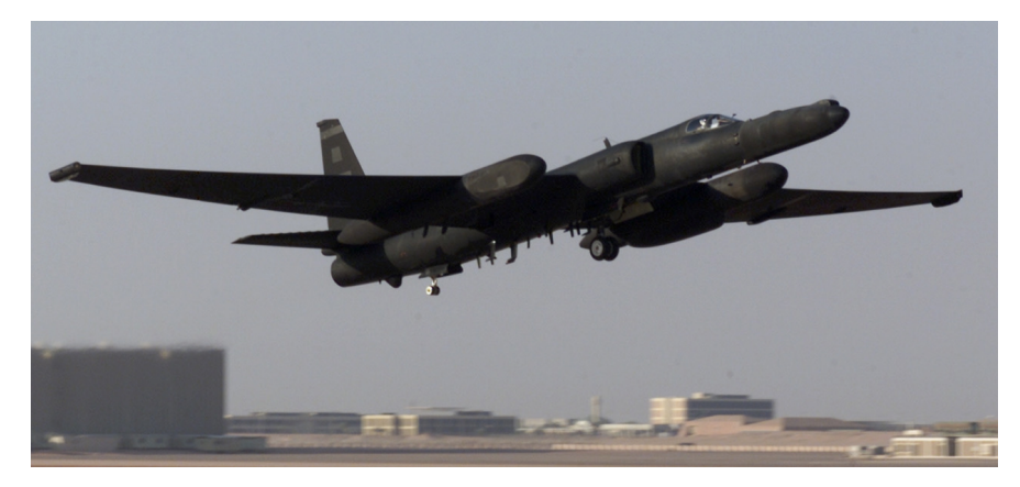
U-2 Dragon Lady

completed over 100 flights, flown in excess of 66,000 ft altitude and 31 hours endurance, and accumulated more than 1,300 hours total flight time. Global Hawk participated in several joint/NATO exercises, to include flying over water to Alaska and completing the first transoceanic crossing to Portugal and back. In spring 2001, Global Hawk flew to Australia for six weeks of demonstrations, including support to Exercise Tandem Thrust. Although still a development system, Global Hawk first deployed operationally in sup-