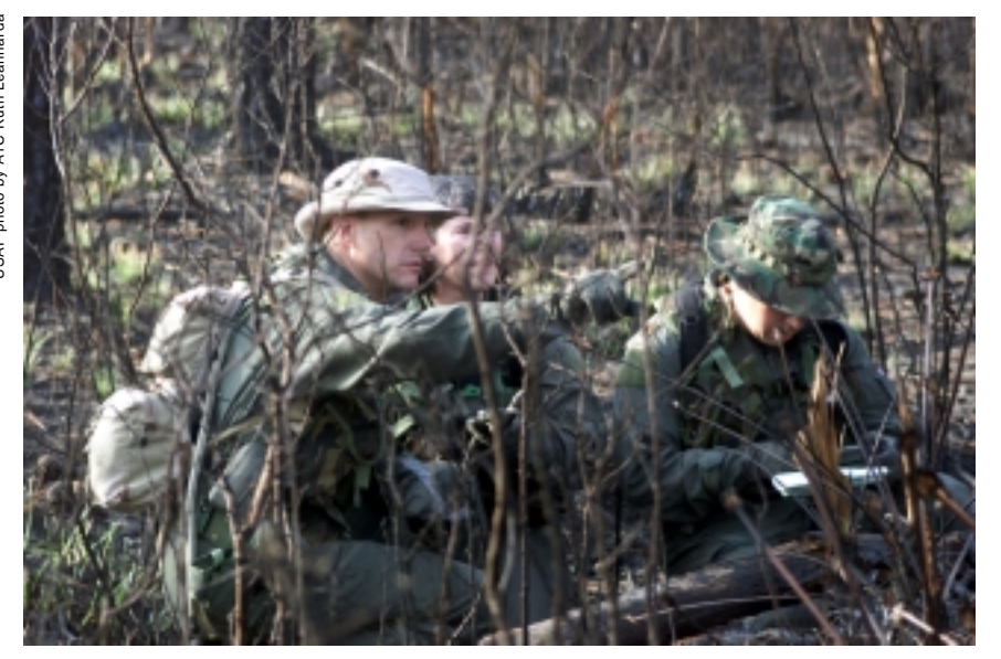
"Survivors" from a simulated aircraft crash move through the Apalachicola National Forest, near Tallahassee, Fla., toward a rescue point during exercise Panhandle Rescue 2001. The exercise allows various types of Air Force units to train together in search-and-rescue situations.