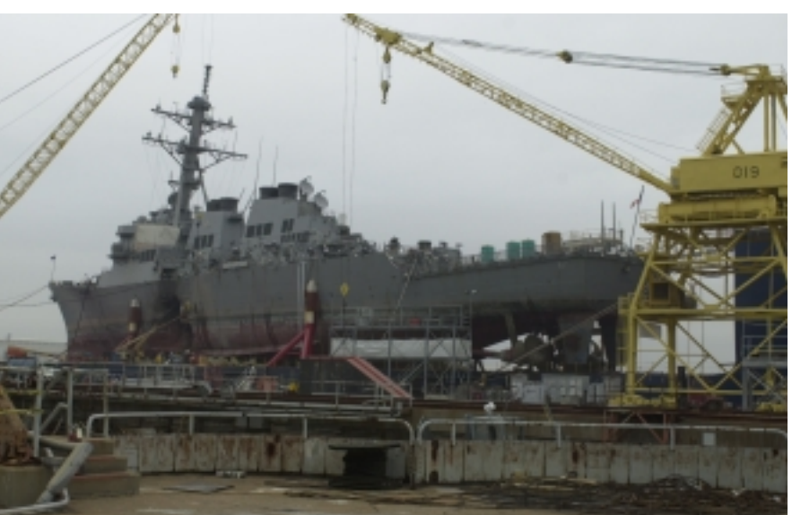
USS Cole during repairs aboard a Norwegian drydock vessel at a shipyard in Pascagoula, Miss.