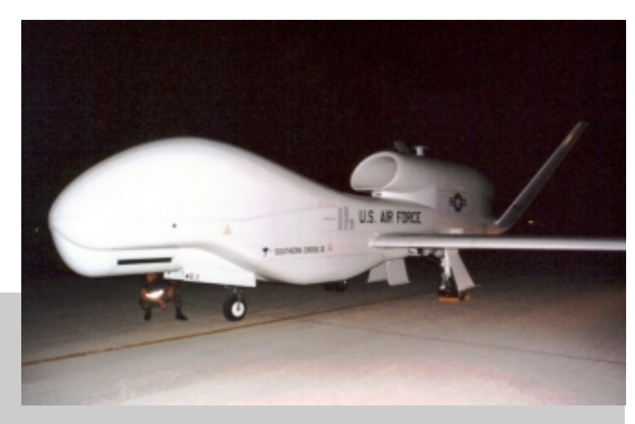
The Global Hawk Unmanned Aerial Vehicle returned to Edwards AFB, Calif., June 8 after a historic trans—Pacific flight to Australia in April. The UAV is to receive $25 million under the defense supplement for this fiscal year.

The biggest single item is $1.9 billion earmarked for personnel benefits. About $1.4 billion of that would pay for expansion in defense health care benefits already mandated by Congress.