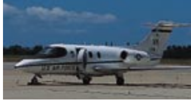
T-1 Jayhawk