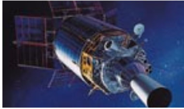
Defense Support Program satellite (Artist's concept)

Block 5D-3. Providing increased capabilities, including improved sensors and a longer life span, the first Block 5D-3 launch is expected this year.