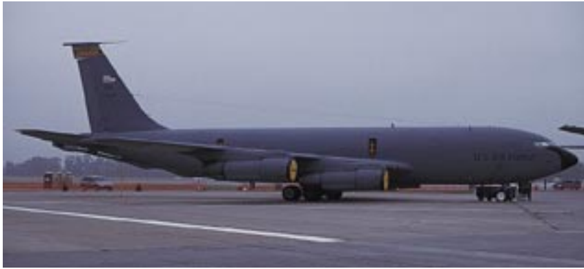
KC-135E Stratotanker (Ted Carlson)

Performance: cruising speed Mach 0.825, range with max cargo 4,370 miles.