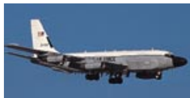
RC-135W Rivet Joint

in real time, via a secure, jam-resistant digital data link to broadcast data to ground forces.