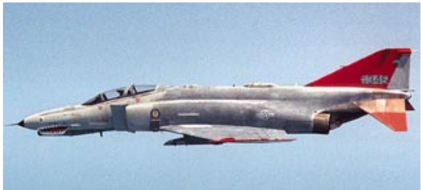
QF-4 (SrA. Matthew C. Simpson)

The F-4 was selected as the source aircraft for the replacement of the QF-106 Full-Scale Aerial Target (FSAT) when the F-106 inventory was depleted. The QF-4 provides for a larger operational performance envelope (maneuvering) and greater payload capability compared with its predecessors. A complement of 331 F-4E, F-4G, and RF-4C aircraft have been allotted for the FSAT conversion program. ■