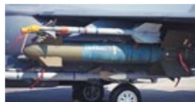
GBU-15 (Guy Aceto)