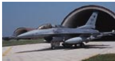
Block 30 F-16D Fighting Falcon (Guy Aceto)