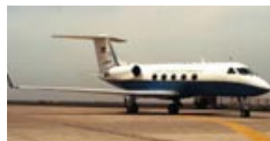
C-20 Gulfstream III