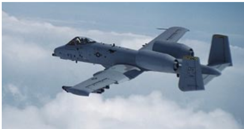
A-10A Thunderbolt II (Guy Aceto)

Armament: one 30 mm GAU-8/A gun; eight under-wing hardpoints and three under fuselage for up to 16,000 lb of ordnance, incl various types of free-fall or guided bombs, Combined Effects Munition (CEM)