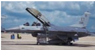
F-16B Fighting Falcon (Guy Aceto)

Reliability and maintainability improvements include a ring-laser gyro INS and installation of the upgraded F100-PW-220E turbofan.