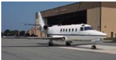
C-38A