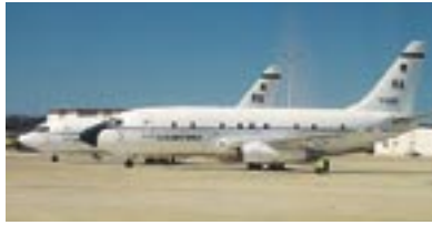
T-43 (Guy Aceto)

The UV-18B is a military version of the DHC-6 Twin Otter STOL utility transport used for parachute jump training at the US Air Force Academy.