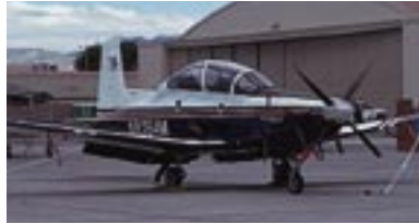
T-6A Texan II