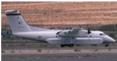
EC-9 (Ted Carlson)

EC-130E Commando Solo. ANG uses this version as a broadcasting station for psychological warfare operations. Specialized modifications include enhanced navigation systems, self-protection equipment, and worldwide color television configuration. Commando Solo aircraft have been used in numerous military operations. They also have a role in civil emergencies.