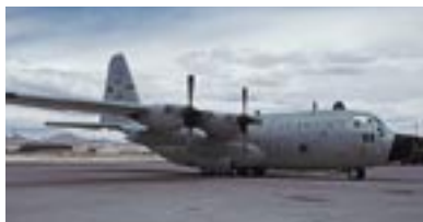
WC-130H Hercules (Ted Carlson)

electro-optic, infrared, and radar imagery, as well as performing other types of intelligence functions. Current upgrades to its sensors, airframe, and cockpit will extend the U-2's usefulness well into this century.