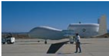
RQ-4A Global Hawk