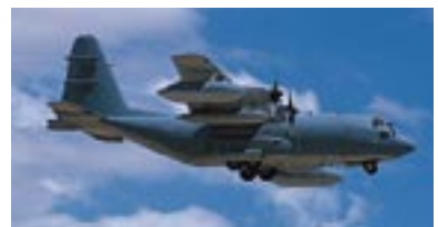
EC-130E Commando Solo