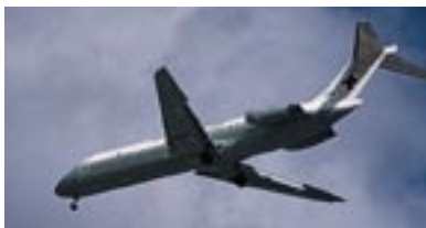
C-9 Nightingale

Function: Operational support airlift; special air missions.