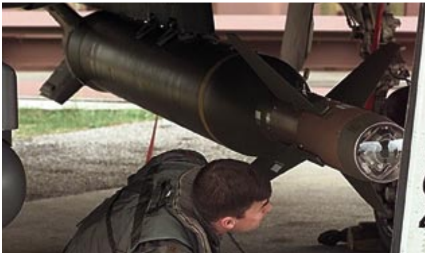
GBU-28