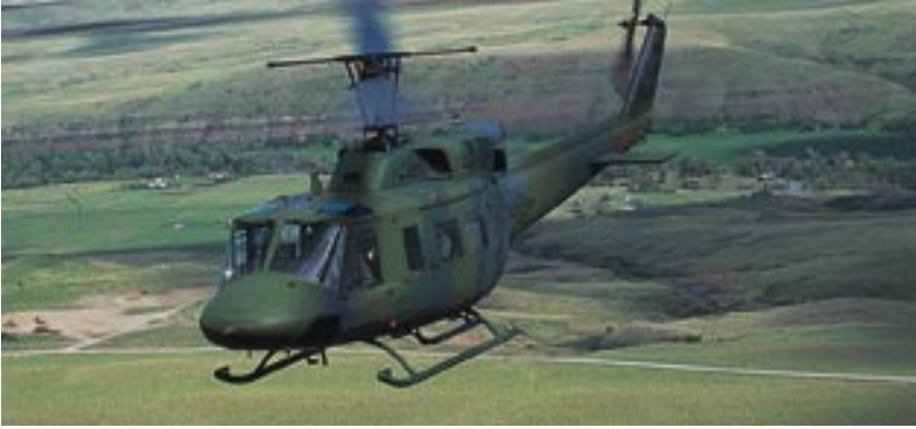
UH-1N Iroquois (Guy Aceto)

armor plating, and an ECM suite with radar and IR missile jammers, flare/chaff dispensers, radar warning receivers, and missile launch detectors.