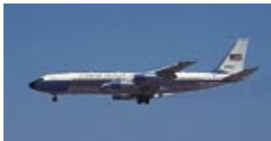
C-137C Stratoliner (Ted Carlson)

Development of this variant of the Marine Corps MV-22 is continuing. It is expected to fulfill the Air Force special operations requirement for high-speed, long-range Vertical/Short Takeoff and Landing (V/STOL) aircraft capable of low-visibility, clandestine penetration/extraction of denied areas in adverse weather.