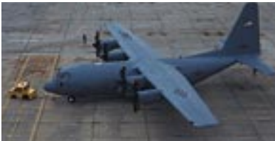
C-130J Hercules (Guy Aceto)