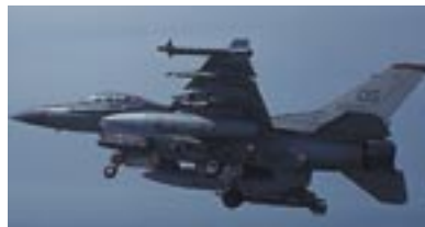
Block 40 F-16CG Fighting Falcon (Guy Aceto)