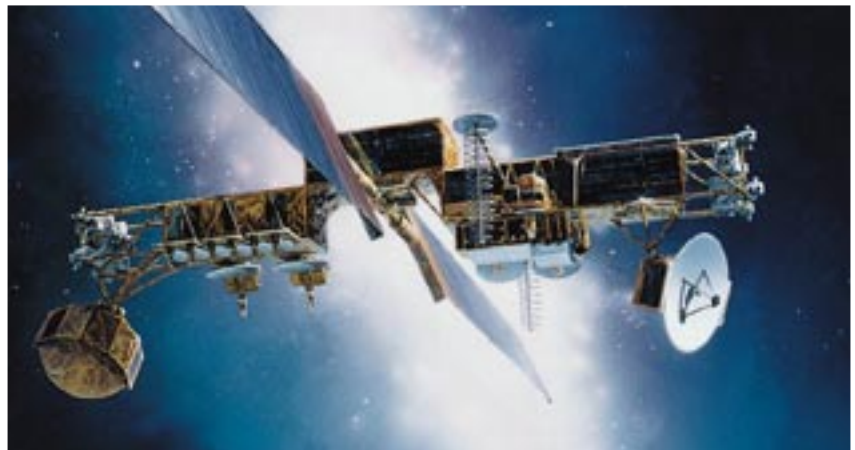
Milstar Satellite Communications System (Artist's concept)