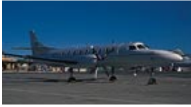
C-26 (Ted Carlson)

Power Plant: two BMW–Rolls Royce BR710A1-10 turbofans, each 14,900 lb thrust.