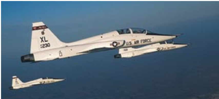
T-38 Talon (Guy Aceto)