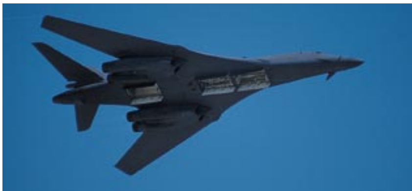
B-1B Lancer (Ted Carlson)

Note: Inventory numbers are Total Active Inventory figures as of Sept. 30, 1999.