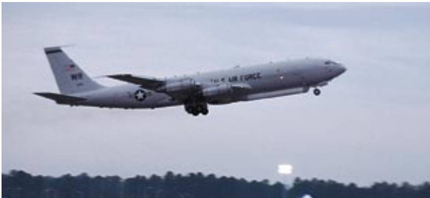
E-8C Joint STARS (Guy Aceto)