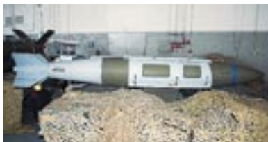
GBU-31 JDAM (Guy Aceto)

Under USAF's rapid-response program, a new bunker-busting weapon was developed for Desert Storm for use against deeply buried, hardened command-and-control facilities. Four of the laser-guided GBU-28 weapons were used in the war: two for testing and two by F-111Fs against a bunker complex Feb. 27, 1991. Guidance is by a modified GBU-27 system.