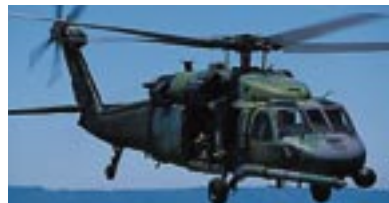
HH-60G Pave Hawk

Unit Location: HH-60G at Eglin AFB, Fla., Holloman AFB, N.M., Kadena AB, Japan, Kirtland AFB, N.M., Moody AFB, Ga., NAS Keflavik, Iceland, Nellis AFB, Nev. ANG: Francis S. Gabreski IAP, N.Y., Kulis ANGB, Alaska, Moffett Federal Airfield, Calif. AFRC: Davis-