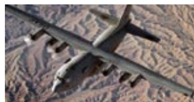
EC-130E ABCCC (TSgt. Lance Cheung)