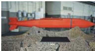
AGM-154 JSOW (Guy Aceto)