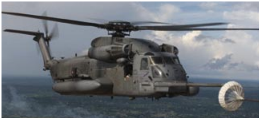
MH-53M Pave Low IV

Monthan AFB, Ariz., Patrick AFB, Fla., Portland IAP, Ore.