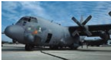
AC-130H (Guy Aceto)