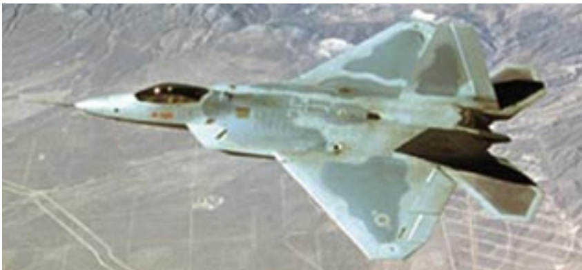
F-22 Raptor (F-22 Team Photo)

Improvements since 1989 have included upgraded cockpit display and instrumentation, GPS capability, and ring-laser gyro INS. Currently undergoing modification to provide a single, optimal LO configuration, adverse weather capability via advanced weapons, and to maintain the fleet through its service life.