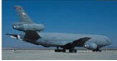
KC-10A Extender