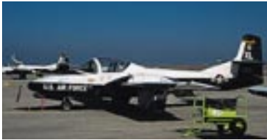
T-37 Tweet (Guy Aceto)