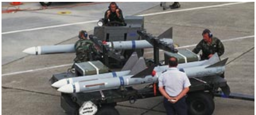
AIM-7 Sparrow (Guy Aceto)