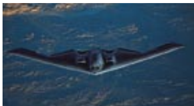
B-2 Spirit (Ted Carlson)

Of blended wing/body configuration, the B-1's variable-geometry design and turbofan engines combine to provide greater range and high speed at low level, with enhanced survivability. Unswept wing setting permits takeoff from shorter runways and fast base-escape capability for airfields under attack. The fully swept position is used in supersonic flight and for high-subsonic, low-altitude penetration.