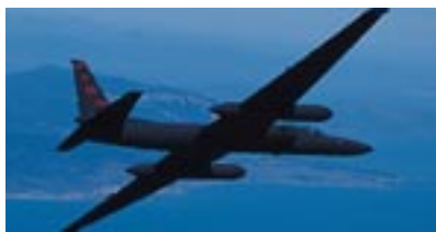
U-2 Dragon Lady