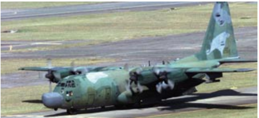
MC-130H Combat Talon II

First Flight: First flown as Air Force One Sept. 6, 1990.