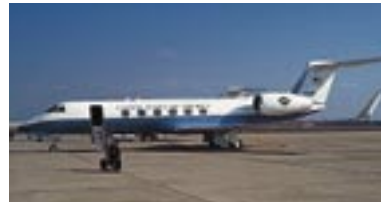
C-37A