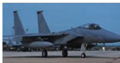
F-15C Eagle (Guy Aceto)