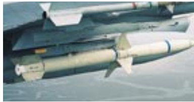
AGM-88 HARM (Guy Aceto)

Maverick missiles were first employed by USAF in Vietnam and were used extensively during the Per-