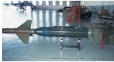
GBU-24 (Guy Aceto)