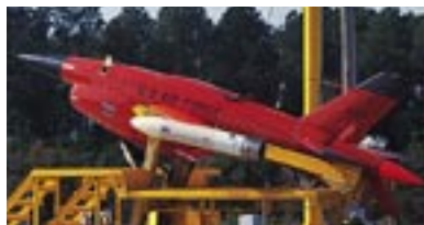
BQM-34 Firebee (Guy Aceto)