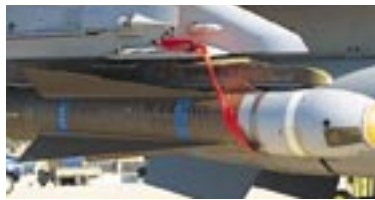
AGM-65 Maverick

sian Gulf War. They currently equip A-10, F-15E, and F-16 aircraft for use against tanks and columns of vehicles and in the SEAD role.