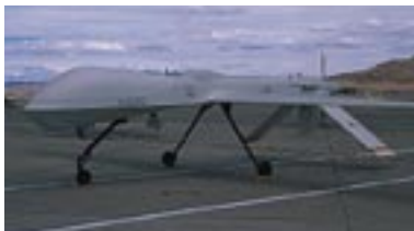
RQ-1A Predator (Guy Aceto)

The U-2 is capable of collecting multisensor photo,