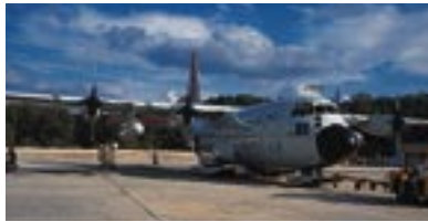
LC-130H Hercules