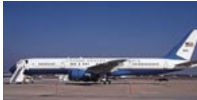
C-32