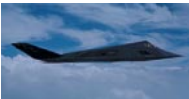
F-117A Nighthawk (Guy Aceto)