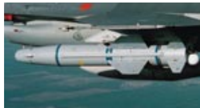
AGM-142 Have Nap