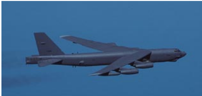
B-52H Stratofortress

B-52D. Long-range bomber version, first flown June