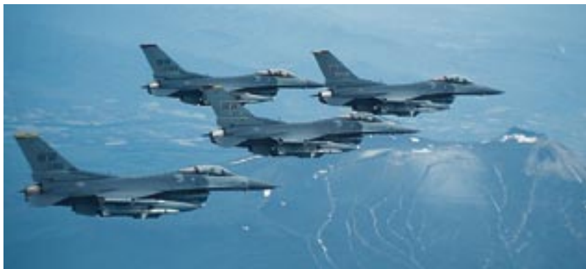
Block 50 F-16CJ Fighting Falcon (Guy Aceto)

The Multinational Staged Improvement Program (MSIP), implemented in 1980, ensured the aircraft could accept systems under development, thereby minimizing retrofit costs. All F-16s delivered since November 1981 have had built-in structural and wiring provisions and systems architecture that expand the single-seater's multirole flexibility to perform precision strike, night attack, and beyond-visual-range intercept missions.