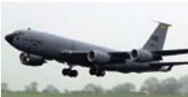
KC-135R Stratotanker

Backbone of the USAF tanker fleet, the long-serving KC-135 is similar in size and appearance to com-