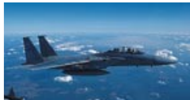
F-15B Eagle (Guy Aceto)