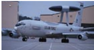
E-3C Sentry (Guy Aceto)

Joint STARS is an all-weather, round-the-clock system comprising an airborne E-8C aircraft (equipped with a multimode radar) and US Army mobile ground stations. The radar subsystem features a multimode, side-looking, phased-array radar with MTI as the primary mode. The radar can interleave MTI with Synthetic Aperture Radar (SAR) and Fixed Target Indicator (FTI) imagery. Joint STARS directs attack on targets,