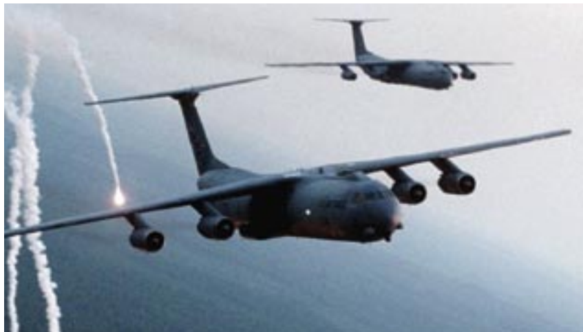
C-141B (SOLL) Starlifter (SrA. Greg L. Davis)

1995. It is the first military transport to feature a full digital fly-by-wire control system and two-person cockpit, with two full-time, all-function HUDs and four multi-function electronic displays. For operational deployments to Bosnia, the C-17 was the only aircraft capable of carrying outsize cargo into Tuzla AB.