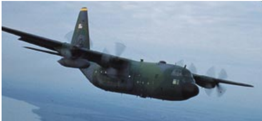
C-130H Hercules (Guy Aceto)

Accommodation: five crew and 12 passengers.