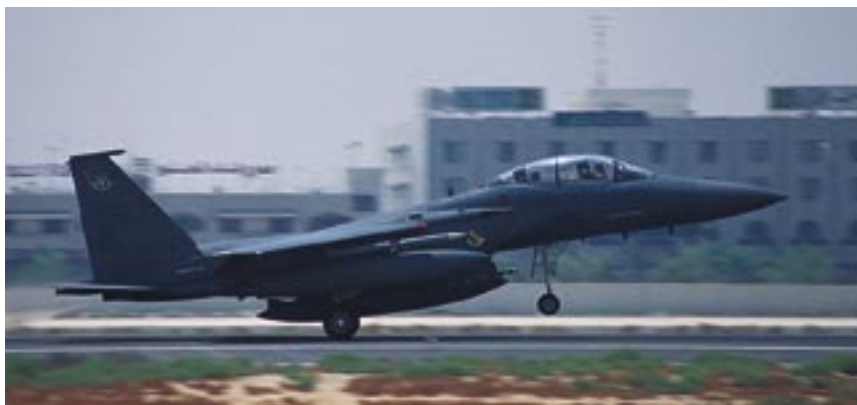
F-15E Strike Eagle (Guy Aceto)