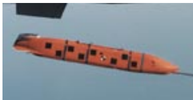
Joint Air-to-Surface Standoff Missile

EGBU-28. Integrates GPS/INS guidance into the existing GBU-28 laser seeker to provide adverse weather capability and improved target location. Entered production in FY98.