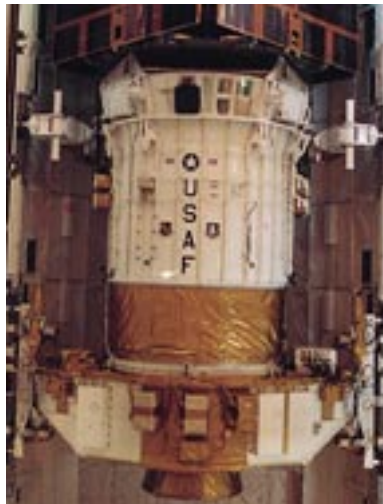
Inertial Upper Stage

Launches Scheduled: one (FY00); none (FY01). Contractor: Orbital Sciences.