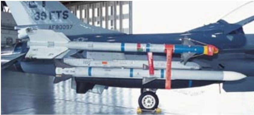
AIM-9 Sidewinder (top), AIM-120 AMRAAM (bottom)

beyond-visual-range air-to-air missile carried by fighters, with high capability to attack low-altitude targets. Pilot may aim and fire several Advanced Medium-Range Air-to-Air Missiles simultaneously at multiple targets and perform evasive maneuvers.