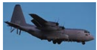
EC-130H Compass Call (Ted Carlson)

Secondary mission is electronic attack in the military frequency spectrum.