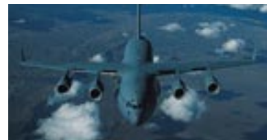
C-17 Globemaster III