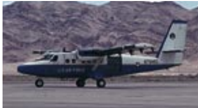
UV-18 Twin Otter