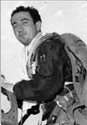
Capt. Joseph C. McConnell Jr.