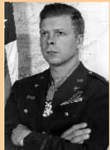
Maj. Richard I. Bong

Ranks are as of last victory in World War II.