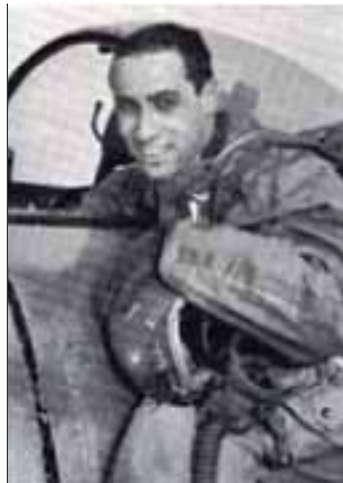
Maj. James Jabara