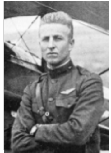
2d Lt. Frank Luke Jr.