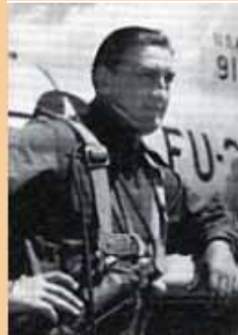
Col. Francis S. Gabreski

a Olds' four additional victories came during the Vietnam War.