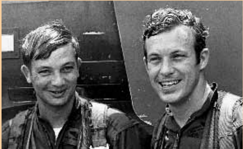
Cpts. Charles B. DeBellevue and Richard S. Ritchie