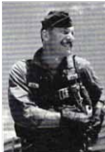
Col. Robin Olds