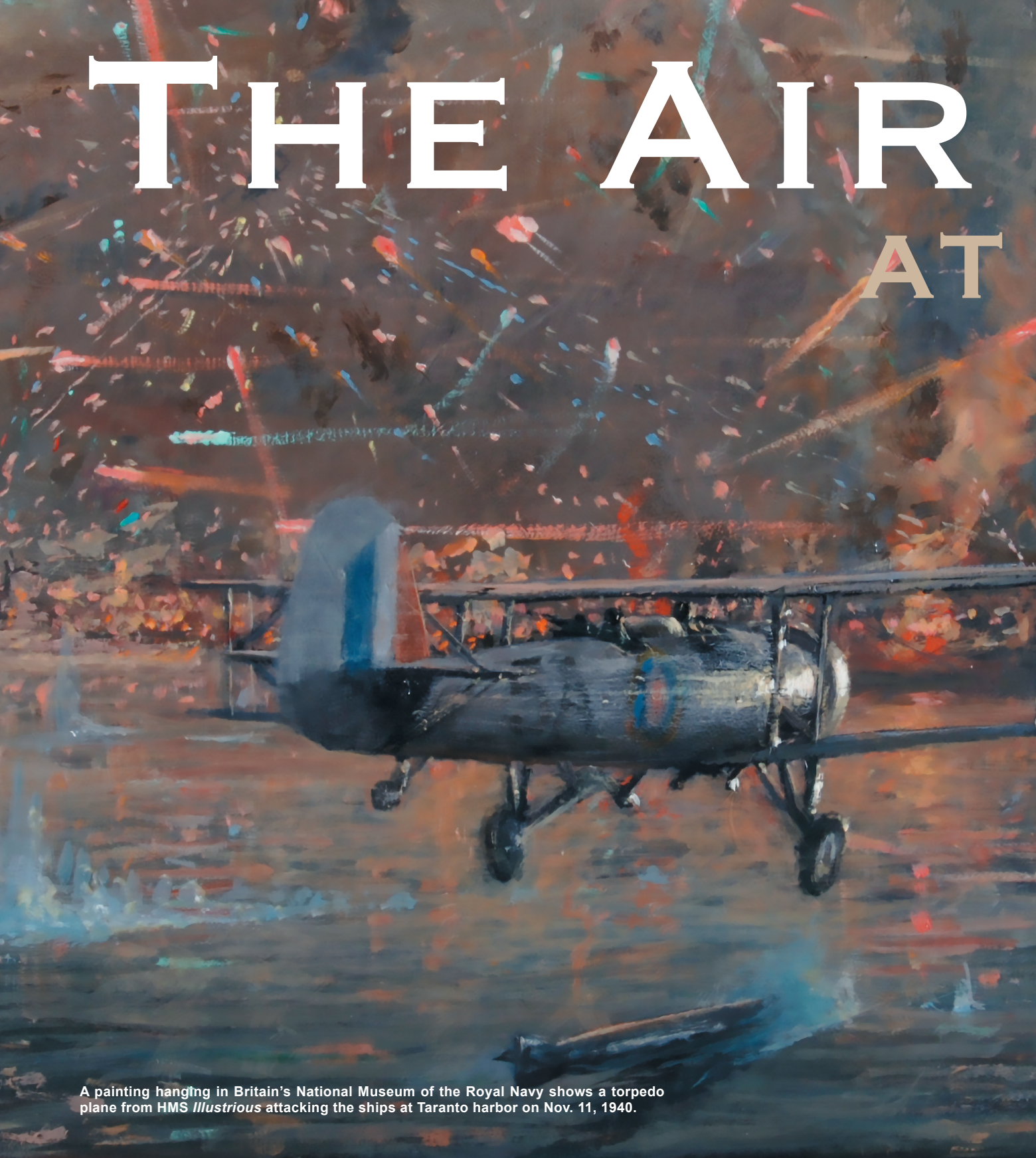
A painting hanging in Britain's National Museum of the Royal Navy shows a torpedo plane from HMS Illustrious attacking the ships at Taranto harbor on Nov. 11, 1940.

Painting by Charles David Cobb, The National Museum of the Royal Navy