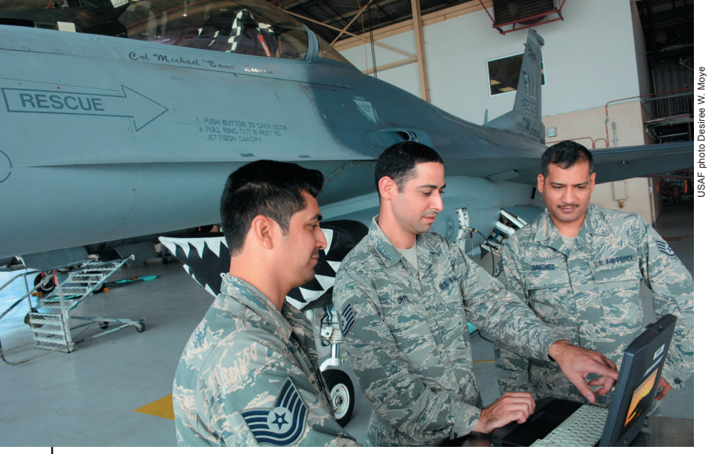
Airmen at Homestead ARB, Fla., explore ways to prevent malware from reaching aircraft. The 482nd Communications Squadron integrates cyber operations into the wing's core mission. Electronic and cyber warfare will make future hybrid warfare conflicts even more challenging.

Euro-Atlantic community than ever," states the NATO study.