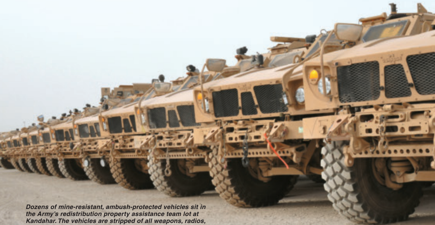
Dozens of mine-resistant, ambush-protected vehicles sit in the Army's redistribution property assistance team lot at Kandahar. The vehicles are stripped of all weapons, radios, and other military equipment, then cleaned and prepared for shipment back to the US.

likely will remain in some capacity after the 2014 deadline expires, said officials.