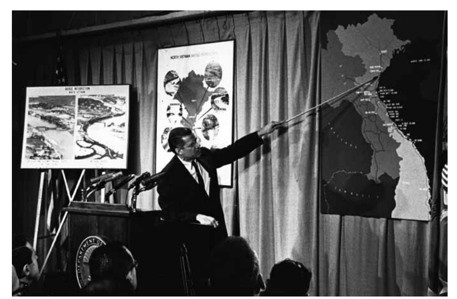
Secretary of Defense Robert McNamara points out communist supply routes during a 1965 press conference. In his 1995 memoirs, McNamara insisted that evidence of the first attack was "indisputable" and that the second attack was "probable."

expending more than 300 rounds, plus depth charges and star shells.