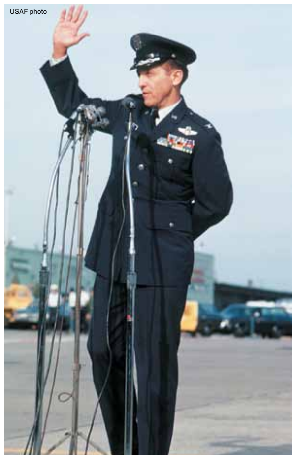
Risner waves to the crowd on his return to the States after his release from the notorious Hanoi Hilton in 1973. Risner was imprisoned for seven years.

The war in Vietnam had not yet broken out in full fury. Although air commandos were flying clandestine combat missions in South Vietnam, US fighters did not deploy to Southeast Asia in strength until after the Tonkin