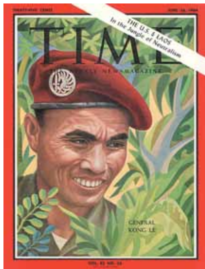
Kong Le on Time Magazine's June 26, 1964, issue.

The situation got worse. In March, Pathet Lao and North Vietnamese moved into the Laotian panhandle where the Ho Chi Minh Trail was formed as an infiltration route to South Vietnam. Kong Le