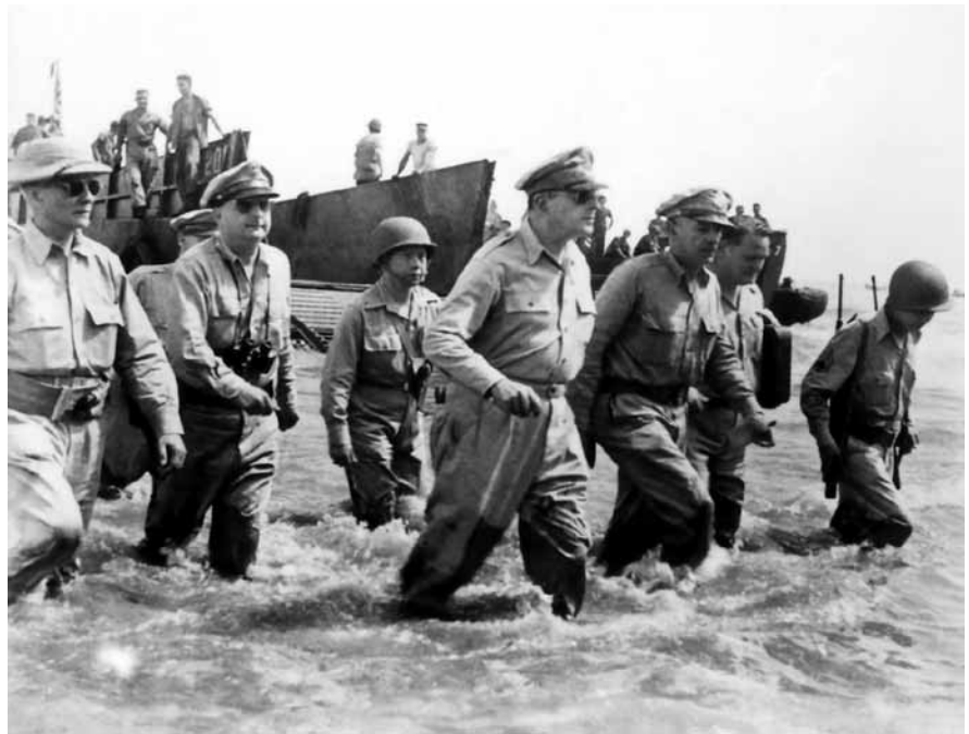
Gen. Douglas MacArthur, commander of Allied forces in the Southwest Pacific, wades ashore at the island of Leyte, Philippines.

Japan continued the fight with fanatical determination in the belief that the willingness of soldiers and sailors to sacrifice their lives would compensate