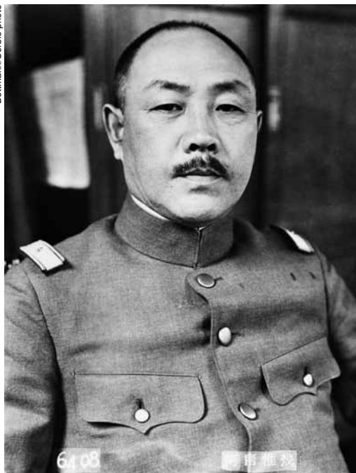
Gen. Korechika Anami, Japan's War Minister, opposed the surrender but would not go against the Emperor.

In fact, Joint Staff planners on two occasions worked up casualty estimates and came out in the same range. In August 1944, using casualty rates from fighting on Saipan as a basis, they said that “it might cost us a half-million American lives and many times that number in wounded” to take the Japanese home islands. An April 1945 report projected casualties of 1,202,005—including 314,619 killed and missing—in Operations Olympic and Coronet, and more if either of the campaigns lasted more than 90 days.