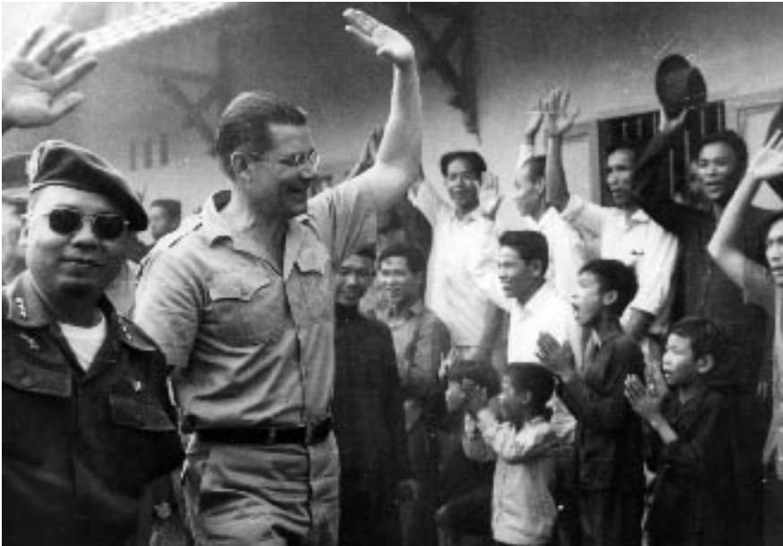
Robert S. McNamara. Before his disillusionment, the Pentagon chief and architect of the war makes an upbeat tour of South Vietnam.

services for input, no consultation with other federal agencies. According to Halperin, these restrictions—as well as the top secret classification—were intended to keep national security advisor Walt W. Rostow from learning about the project, telling Lyndon Johnson, and getting it canceled.