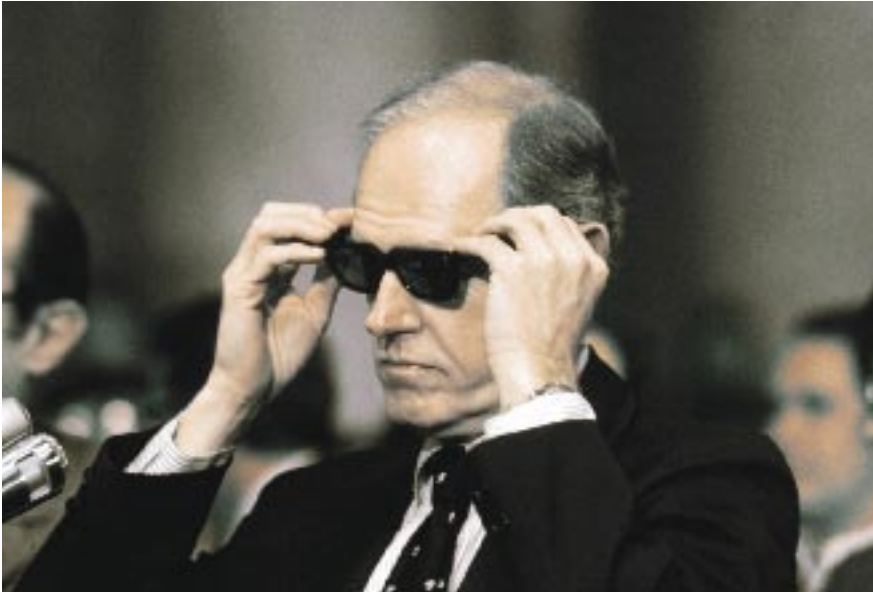
E. Howard Hunt. Along with G. Gordon Liddy, Hunt on Sept. 3, 1971 burglarized a doctor's office, seeking dirt on Ellsberg. Watergate came nine months later.

1971 reprinted the Times reports and sold 1.5 million copies.