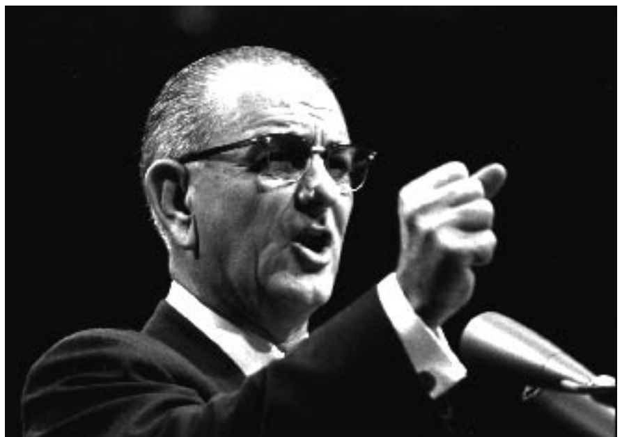
Lyndon B. Johnson. The Texan, seen here in 1964, soon became a war president. He later suspected McNamara of conniving with Robert F. Kennedy.