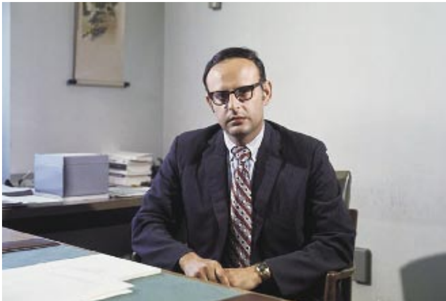
Leslie H. Gelb. DOD policy planning head had day-to-day control of the study. He later became a State Department official and New York Times correspondent.

a coup under responsible leadership has begun, ... it is in the interest of the US government that it should succeed.” Bundy said there should be no direct US intervention on either side “without authorization from Washington.”