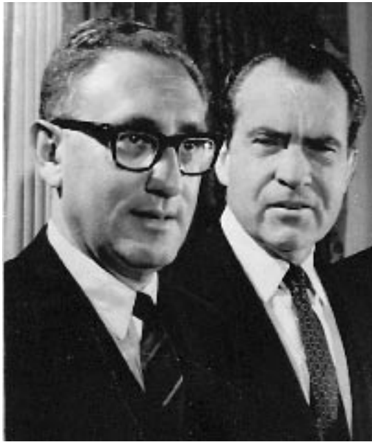
Henry A. Kissinger (I) and Richard M. Nixon. At first, Nixon ignored the leak, but Kissinger convinced him he had to act on “this wholesale theft and unauthorized disclosure.” Once energized, Nixon became obsessed, organizing his own group of unofficial “plumbers” to plug national security leaks.

anything right. The telegram was mistakenly transmitted to a fish company in Brooklyn.