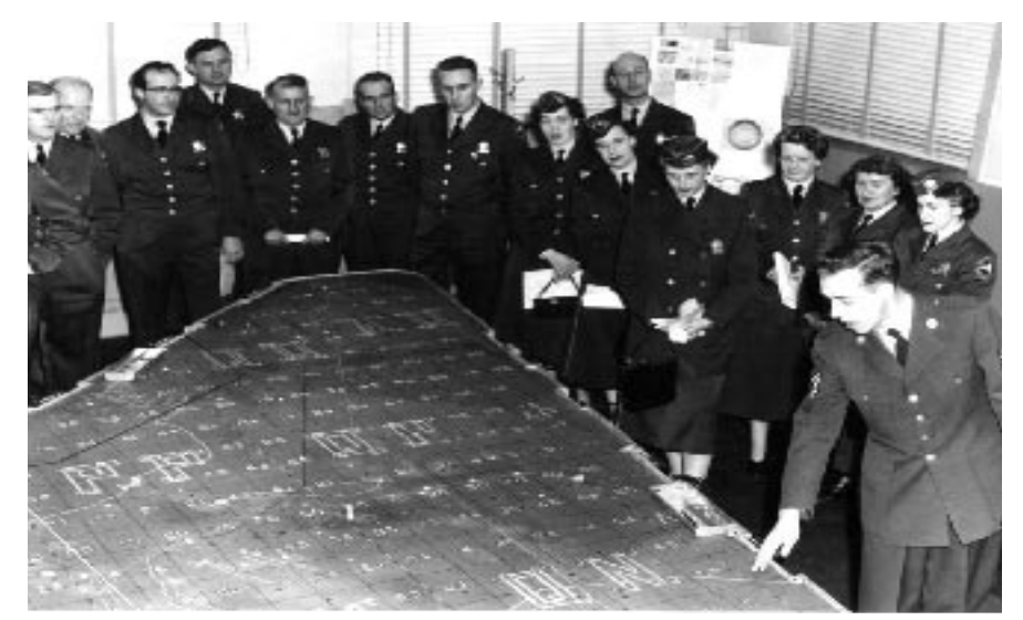
In the early days, GOC used horizontal plotting boards, such as the one shown here at the Syracuse filter center. Models were moved manually around the board to indicate the position of an aircraft.

These active defense measures were in contrast to the passive measures such as dispersion of aircraft, camouflage, blackouts, and other routine precautions.