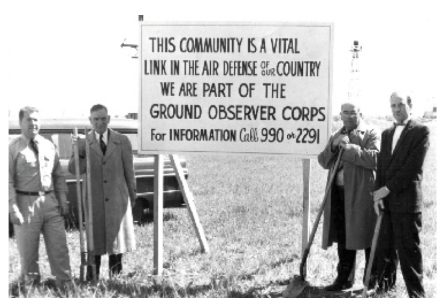
Pictured is a groundbreaking ceremony for a GOC observation post in New York state. GOC posts were constructed on top of existing buildings or on hilltops—any place with a clear, unobstructed view of the sky.