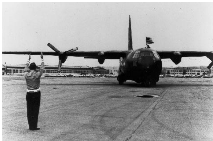
Gunships gave the Air Force the most bang for the buck against the trail. At the peak of Commando Hunt VII, AC-119s hit 3.3 enemy trucks per sortie, while the new AC-130 (shown) hit 8.3 North Vietnamese trucks per sortie—by far the best result.

How effective was the seven-year air war against the Ho Chi Minh Trail? On that, opinions vary widely. Many of the strikes were at night against targets moving through jungle cover. Even when there were fires or explosions, it was difficult to be certain about the damage inflicted.