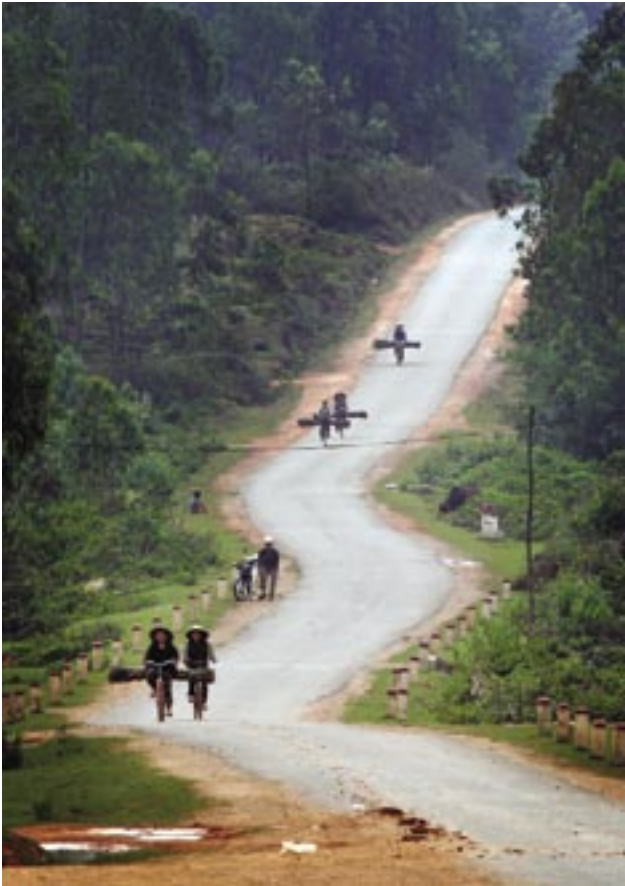
In modern Vietnam, the Ho Chi Minh Trail is legendary. A highway from Hanoi to Ho Chi Minh City (Saigon) goes under the name "Ho Chi Minh Trail," but it is entirely in Vietnam. Shown are bicyclists traveling the highway earlier this year.

The Air Force reported 46,000 trucks destroyed or damaged during the four Commando Hunt dry season campaigns, with the count distributed as follows: