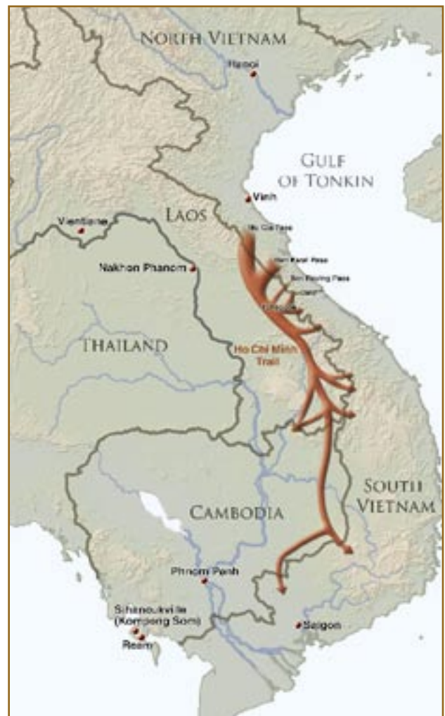
The Ho Chi Minh Trail stretched hundreds of miles through Laos and Cambodia before terminating in South Vietnam. Mountain passes allowed access to that beleaguered country.

In 1962, the United States and North Vietnam were among the nations signing the Geneva Accord agreeing to the neutrality of Laos. The United States duly removed all of its troops, but the