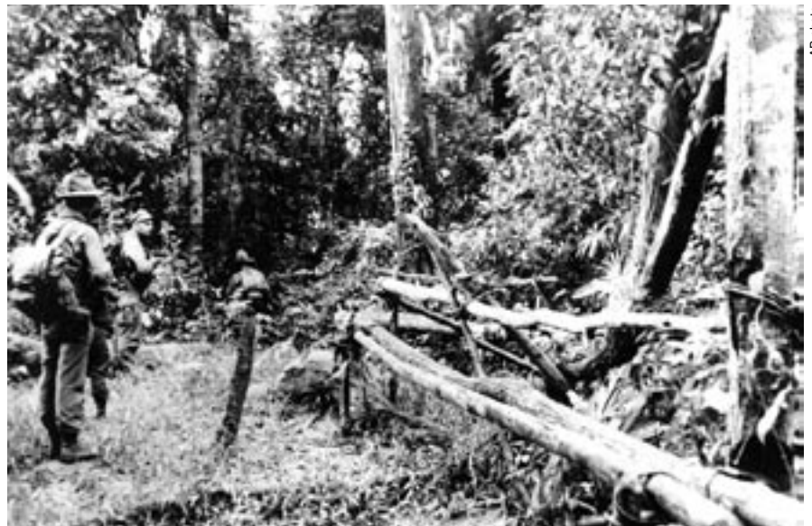
In this 1964 photo, a US military advisor and South Vietnamese troops patrol a point where the trail entered South Vietnam. On the right are crude benches offering a resting place for those carrying supplies.

Both infiltration and air strikes declined sharply during the wet season, the southwest monsoon, from May to September. The rains washed out roads and trails. To some extent, supplies could move on swollen waterways, but Viet Cong and North Vietnamese soldiers in the South depended mostly on stores built up during the dry season.