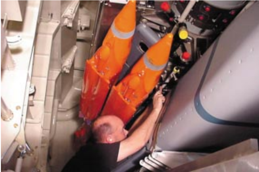
Operating behind enemy lines, the FB-22 would deliver air support to dispersed ground forces and special operations forces. It could carry more than 35 Small Diameter Bombs, shown here in a B-2 weapons bay.

option—could indeed be developed and fielded “in less than a decade.”