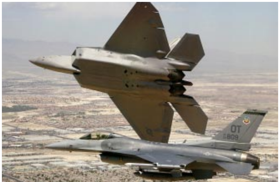
The FB-22 could use the avionics and upgrades developed for the F/A-22—an enormous savings of time and money. Above, an F/A-22 finishes up operational testing with an F-16C chase airplane over Nellis AFB, Nev.

Lockheed believes the Air Force will want a two-seat FB-22. The second seat would accommodate a second pilot, who could relieve the front seater on long missions—the aircraft could be flying 15 hours or