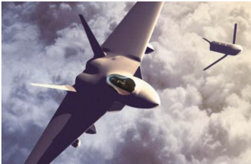
With missions of more than 15 hours, the FB-22 likely would have a two-pilot cockpit. The second pilot could spell the front seater and handle weapons management, as well as other missions.

The aircraft, he said, had “the following characteristics. ... One is, it goes equal to or farther than the B-2, so, say 2,500 miles; it has the capability to fight so as to put stealth in