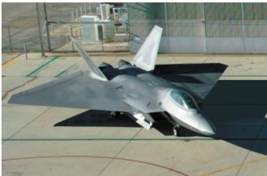
Lockheed Martin artist's concept

He also believes that the FB-22—or, as he described it, “an FB-22-like thing” to avoid implying that it is already the Air Force’s preferred