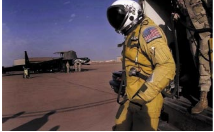
Building a Portfolio. In summer 2002, Air Force ISR assets, such as this U-2 flown by Maj. Jonathon Guertin, stepped up their efforts to develop a comprehensive catalog of threats, targets, terrain features, and enemy tactics.

fire was up throughout Northern and Southern Watch, as compared to the same period in the preceding year.