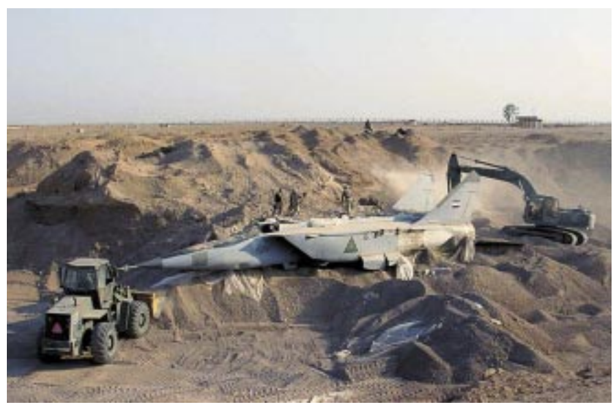
Beyond Supremacy. Southern Focus led to air dominance. Iraq's air force did not come out during Iraqi Freedom and even buried some MiG-25s to try to save them. Coalition forces dug them up after the war.

According to the Air Force, coalition aircrews dropped 606 bombs on 391 targets during Southern Focus, which lasted from June 2002 to the March 20, 2003, start of Gulf War II.