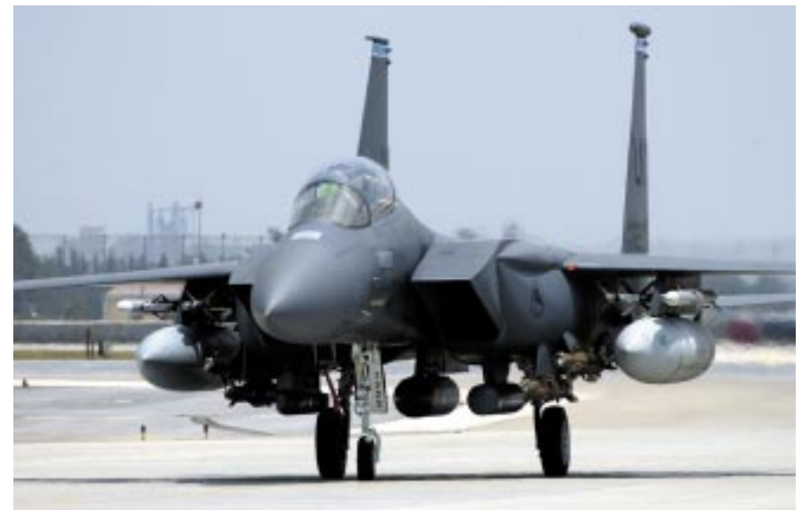
Tactical Change. Under new rules of engagement, coalition aircraft such as this F-15E could respond to Iraqi attacks by striking command, control, and communications nodes as well as air defense radars and guns.

attacks on US and British aircraft patrolling the no-fly zones. Since 1992, Iraqi military forces had fired anti-aircraft artillery or surface-toair missiles during almost every coalition aircraft patrol. The aircrews returned fire—sometimes immediately, sometimes a few days later. Over the years, attacks outnumbered responses by a 10-to-one margin, according to Defense Secretary Donald H. Rumsfeld.