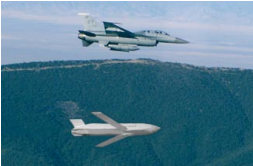
Extending the reach of bombers and fighters alike, the stealthy Joint Air-to-Surface Standoff Missile is already available on the B-52. It will go after heavily defended targets deep in enemy territory. (An F-16 flies chase during a test.)