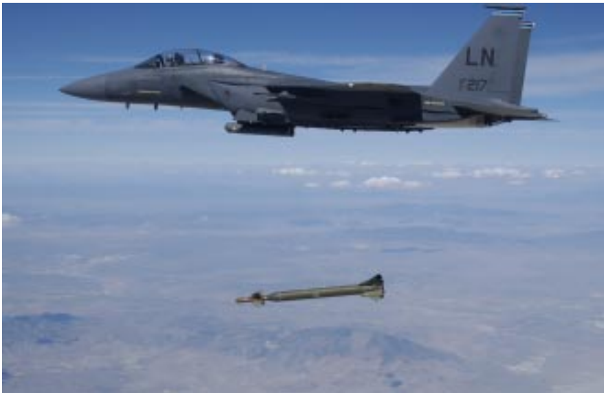
Laser guided bombs still edged out JDAMs as the most-used guided weapons in Gulf War II and are as yet unmatched for accuracy. This is a GBU-28 “bunker buster” LGB being released from an F-15E.

Moreover, it was able to take advantage of information from airborne sensors, satellites, and special operations forces on the ground.