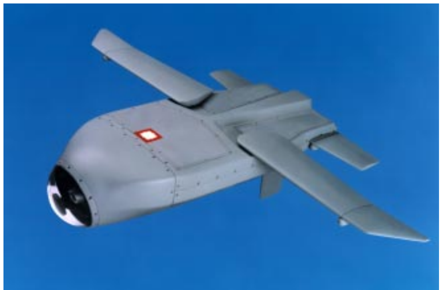
Smaller, smarter, and able to loiter—that’s the future of PGMs. Lockheed Martin’s tiny LOCAAS attacks in swarms and ignores targets other than its own. If it can’t strike its designated target, it destroys itself in air, avoiding collateral damage.