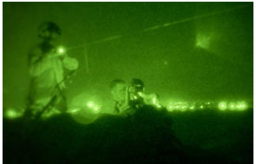
Armed with lasers and handheld GPS units, Air Force controllers are able to call in close air support strikes from 40,000 feet and hit targets that are mere feet away from their own positions with ground forces.