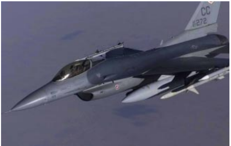
An F-16 from the 27th Fighter Wing, Cannon AFB, N.M., patrols southern Iraq carrying a load of AGM-88 HARM. USAF aircraft supporting the no-fly zone operations carry a mix of air-to-air and air-to-ground munitions.