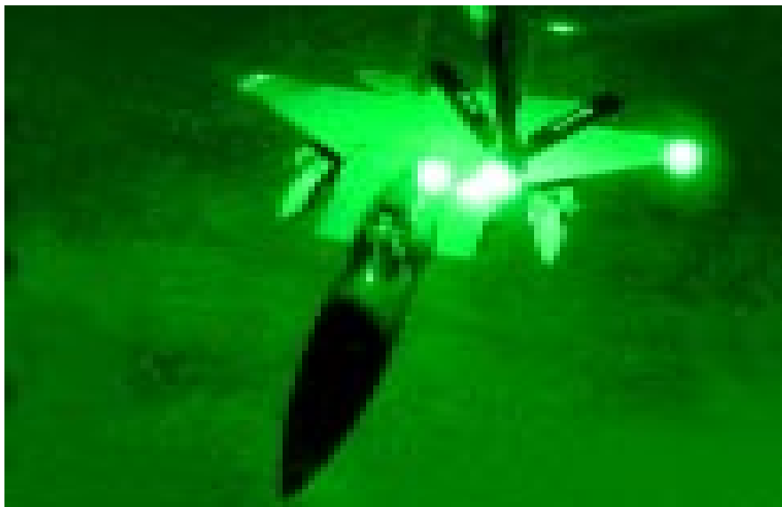
An F-15 takes on fuel during a nighttime no-fly zone patrol. Northern and Southern Watch are useful “labs” in which to test new concepts and equipment, but the operations take a toll on training.

most of the burden of the no-fly zone patrols, the operations have been a particularly defining event and directly shaped its post-Cold War structure.