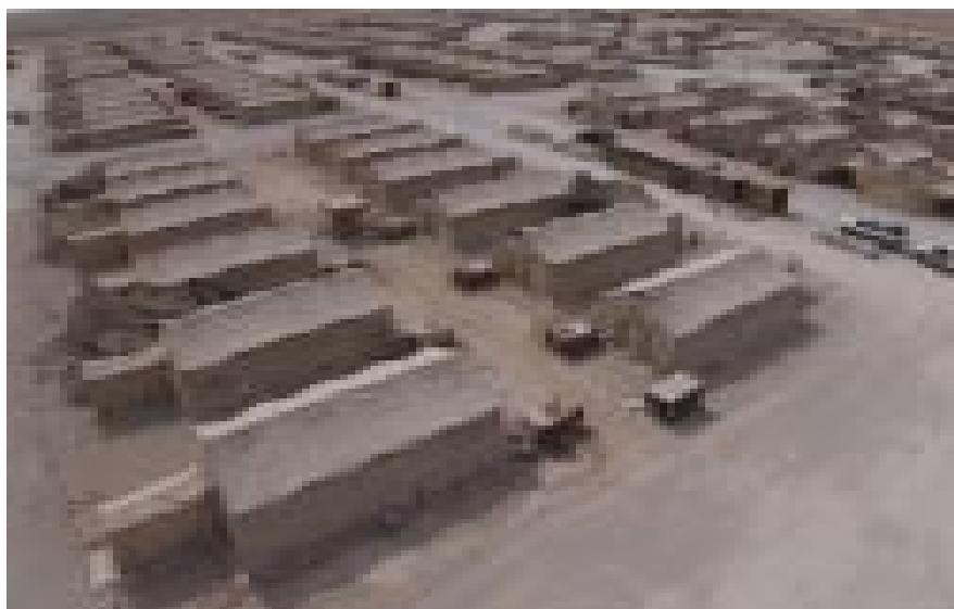
Gen. Michael Ryan restructured USAF into the Expeditionary Aerospace Force in 1999, largely to deal with the burden of running the no-fly zones. Tent cities, such as this one in Qatar, are common sights in Southwest Asia.

Provide Comfort was renamed Northern Watch on Jan. 1, 1997, with headquarters at Incirlik AB, Turkey, and orchestrated by US Air Forces in Europe. British aircraft patrolled intermittently in the northern operation. France had flown patrols during Provide Comfort but stopped in December 1996.