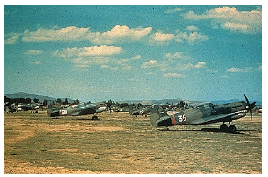
Conditions for the Flying Tigers were spartan and resources were scarce. Above, P-40s cocked and ready to go from a typical Chinese airstrip.

nese airplane a pilot destroyed. Roosevelt and Knox gave the group's transport ship an escort of two Navy cruisers to see them across the Pacific.