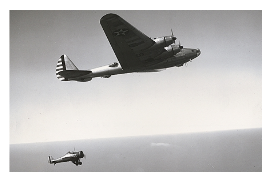
Great leaps in bomber design swayed many but not Chennault. He insisted that even the massive B-15, shown here with a P-26, needed a fighter escort.

Later in 1933, more air exercises were held, and Chennault helped