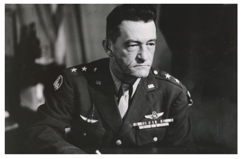
Chennault, pictured here as a major general, wore not only US wings but also those of the Chinese air force.

East made him an enduring legend. When he died in 1958, the New York Times put his obituary on Page One.