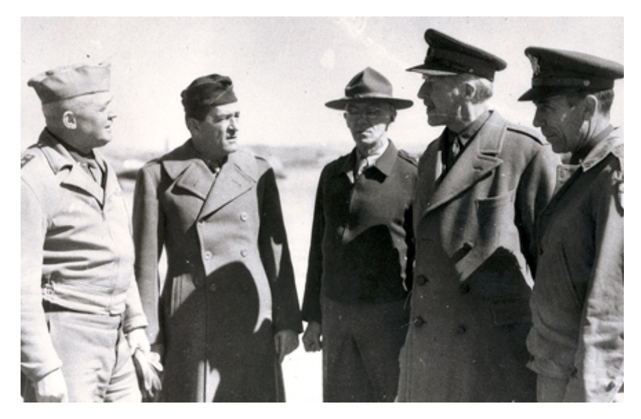
Hap Arnold (left) met with Chennault and American and British officers at a Flying Tiger base during a trip to China.

enced at flying together "need not follow an inflexible rule as to relative positions in formation in order to get effective results."