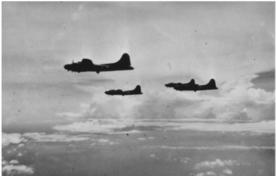
Schriever flew 38 combat missions in World War II and developed a flare-dispensing system for night attacks and tested it from B-17s in night raids on Rabaul. Here, bombers are on a mission to Rabaul.

After spending 42 months overseas, Schriever returned home to an assignment in the Pentagon. The Army Air Forces were in the midst of a precipitous demobilization and