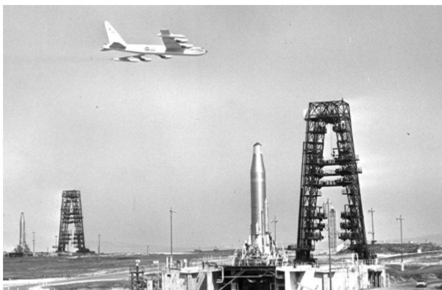
A Strategic Air Command B-52 flies over an Atlas missile and gantry at Vandenberg AFB, Calif. A SAC crew launched the first Atlas in September 1959. By 1963 SAC had 13 Atlas squadrons.

When success came, it was on an extraordinary scale. The first Atlas was launched by a Strategic Air Command crew from Vandenberg AFB, Calif., on Sept. 9, 1959. Deployment went ahead at a feverish pace, despite the requirement to put a large part of the Atlas force in huge under-