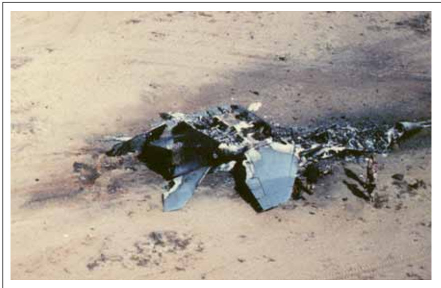
Strategic Control means the enemy's options steadily narrow, as his assets are steadily destroyed or immobilized. Once crippled—and having lost his goals—the enemy's choice will be to endure more punishment or give in.

While there has been much talk in the last few defense reviews