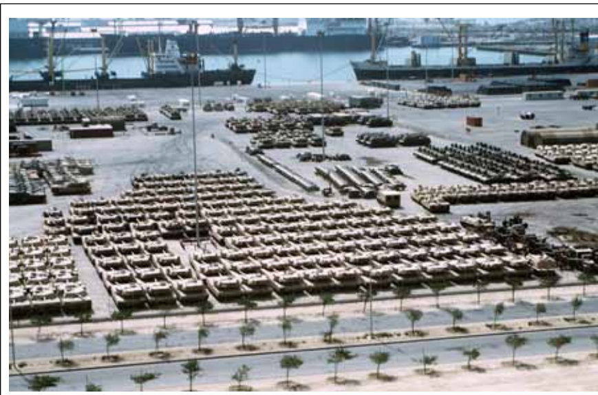
Future crises may not offer the luxury of months to move massed troops and vehicles into position for a large ground war. Such strategies also serve the enemy’s purpose by putting American troops at risk.

If indeed “manipulating time is in principle more important than