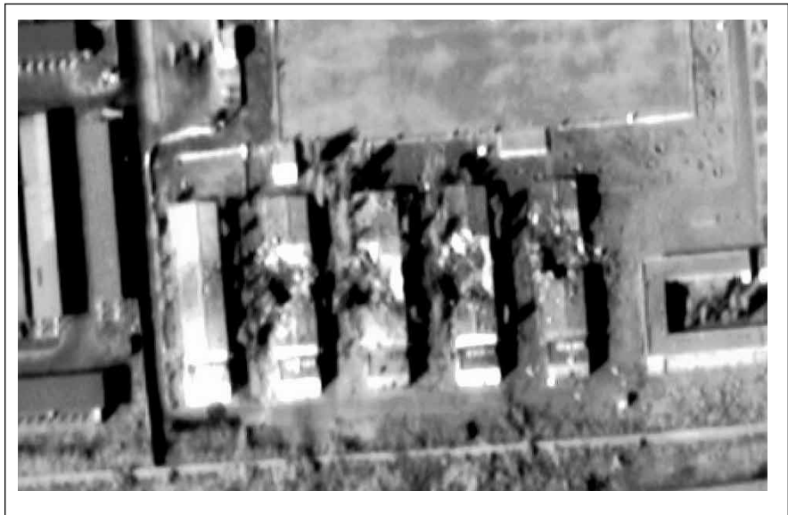
As this Desert Fox image shows, there’s little question that US airpower will hit what it aims at. In Strategic Control, emphasis is added to picking the targets that will most rapidly collapse the enemy’s willingness to fight on.

If the way is to go forward, he said, it requires more than “doing the traditional military task better, smarter, faster. Change involves reinventing the tasks in light of new capabilities. We are not in the mold of doing more with less. We need to reinvent ourselves. We need to be true to our values but flexible in our methods. Notions of speed, effectiveness, responsiveness, survivability, precision, and the use of violence are becoming universal criteria for the new American way of war.”