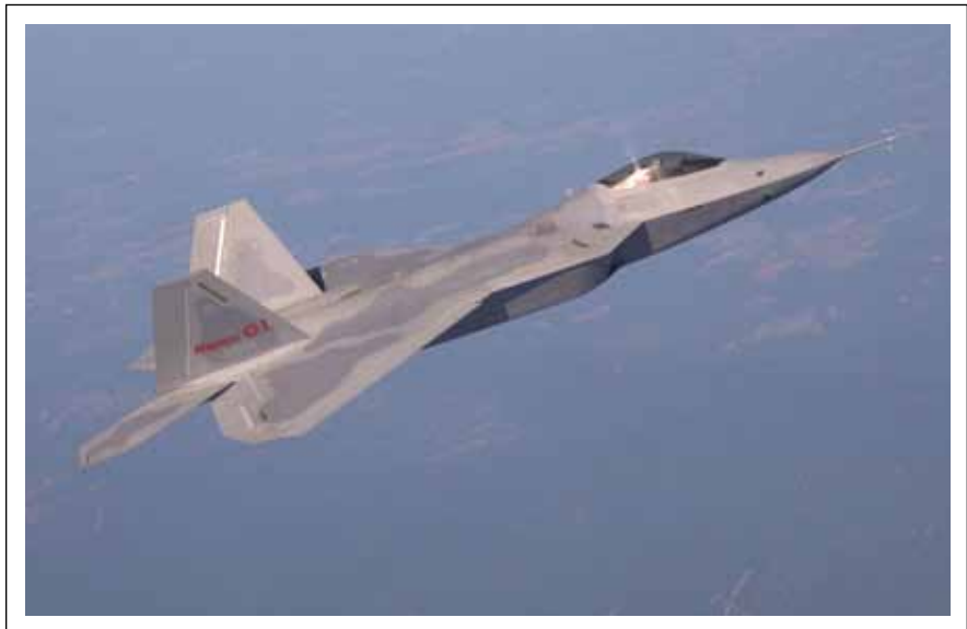
The F-22 epitomizes the speed, stealth, range, and precision required of all US systems—land- and sea-based alike—if Strategic Control is to succeed.

States today is “the only full-complement, full-dimensioned aerospace power. It’s a status for the United States to keep or lose as a matter of choice.” The continued pre-eminence of the US in strategic aerospace capabilities is “not a given. And of course, it’s not free.”