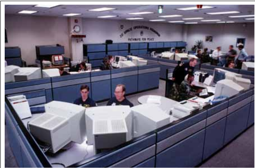
How America fights will be forever changed by the ability to find, track, target, and destroy anything of significance on the surface of the Earth. Doing much of the mission from home base, like these GPS controllers, reduces US vulnerability.

To live within its means, the US military probably will have to make painful changes, but so far the services have chosen to become smaller versions of their Cold War selves rather than set off in radically new directions. Various panels of experts have pressured DoD to get a new, coherent vision to rationalize forces and “transform” the military into something entirely new, but none have endorsed a truly original vision.