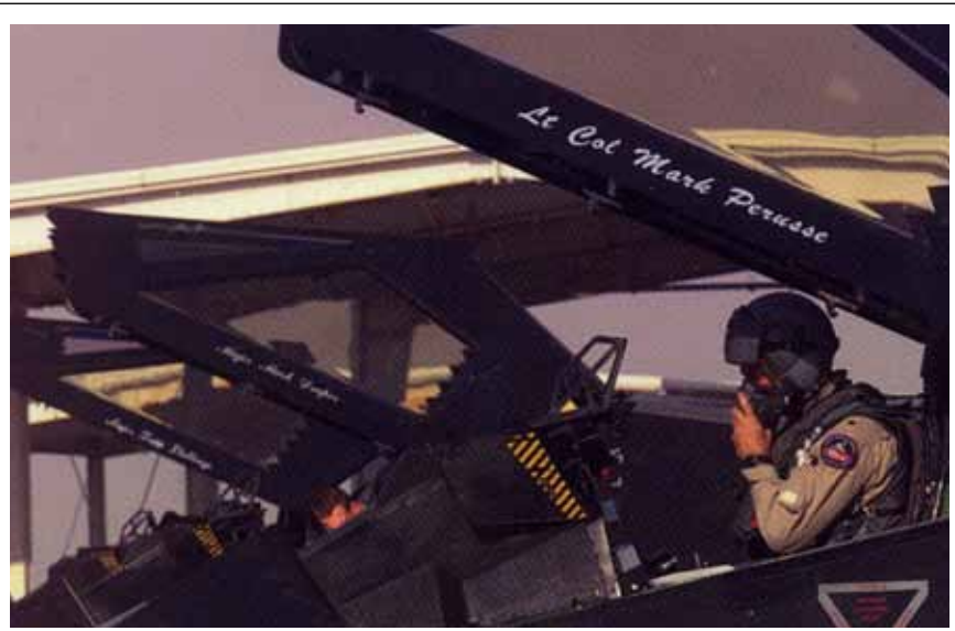
Speed is a hallmark of the Revolution in Military Affairs, and fast-moving Air Expeditionary Forces are a linchpin of Strategic Control. AEFs can be deployed, used, and turn for home in a matter of days.

and critique the QDR and tell Congress whether the QDR's findings made sense. Unlike the QDR, which put Rapid Halt as a fundamental enabler of the two-war strategy, the NDP did not even mention Rapid Halt or the Halt Phase, even though the concept was by then maturing with the convergence of Parallel Warfare and the Revolution in Military Affairs.