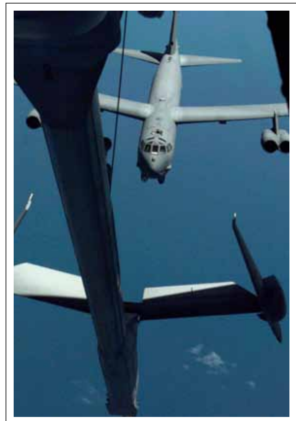
With aerial tanking, range is only limited by the endurance of the crew. Operating outside the range of enemy weapons—especially ballistic missiles and other weapons of mass destruction—will be a vital goal in the future.