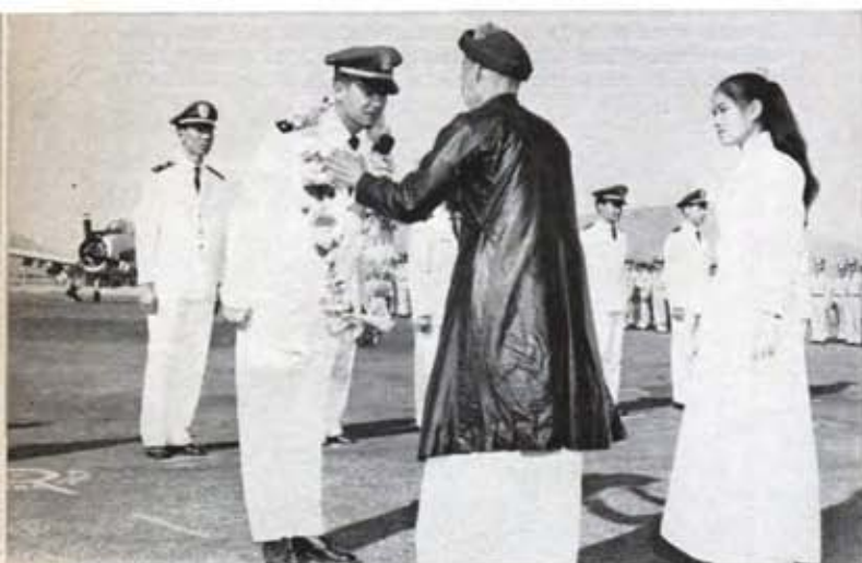
During formal ceremonies on the Nha Trang Air Base ramp marking the Squadron's first anniversary, a pilot hero of Vietnam's "Strategic Hamlet" program receives a floral garland presented by the hamlet patriarch and his daughter.