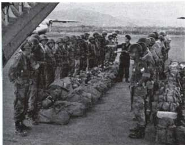
South Vietnamese troops are checked out before boarding a C-123 in Operation Phi Hoa II in March, a tactical air-ground envelopment strike against a force of hard-core Viet Cong regulars fifty miles from capital city of Saigon.