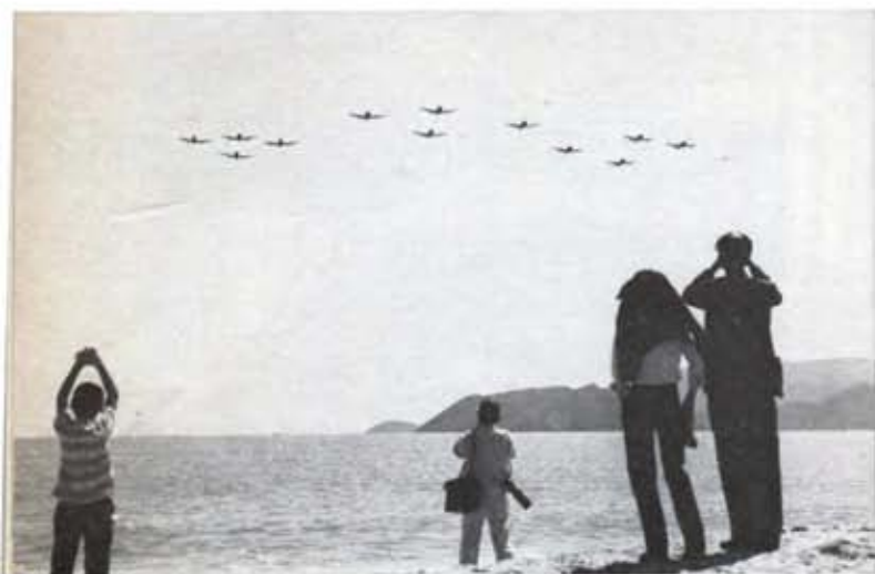
Pilots of Vietnam's 516th Fighter Squadron form up over Nha Trang Bay for finale of first anniversary air show. Most of them took pilot training in the US, followed by intensive combat training under USAF advisers in Vietnam.