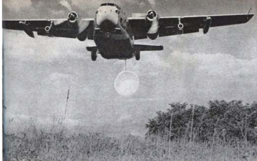
This jet-assisted C-123 assault transport being field-tested in Vietnam uses drag chute to deliver heavy cargo loads in isolated areas without actually landing. Wide track gear permits landing on grass or sand.