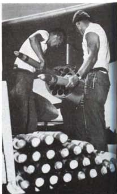
USAF Air Commando crewmen load 2.75-inch rockets in wing pod of B-26 bomber. Commandos, based at Hurlburt Field, Fla., rotate to Vietnam for periods of four to six months.