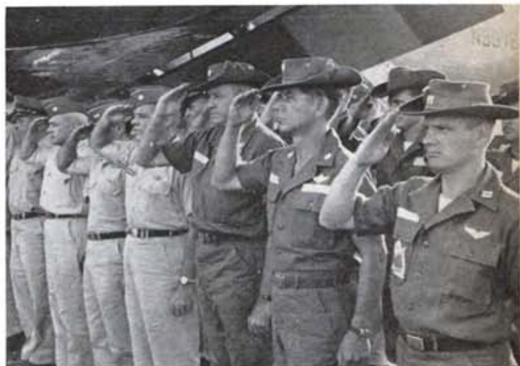
USAF Air Commandos render final salute to three B-26 crewmen in planeside services at Tan Son Nhut Air Base, Saigon, before bodies were flown back to US. Ten airmen—seven Americans, three Vietnamese—have died in B-26 crashes.