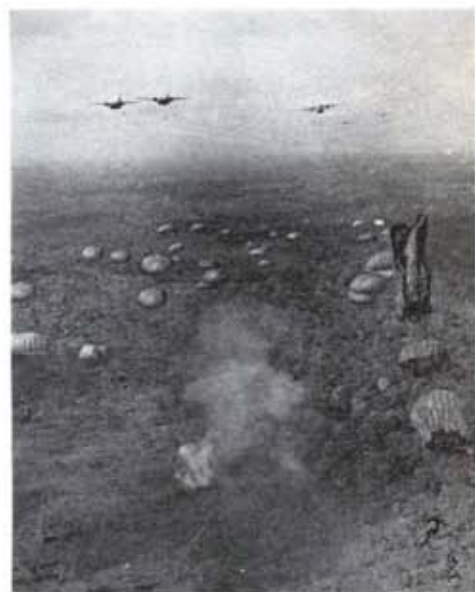
After B-26s and A-1Hs had worked over the Phi Hoa II drop zone with frag bombs, sixteen C-123s dropped 840 Vietnamese paratroops in two minutes. Army H-21 helicopters followed with 1,500 more troops.