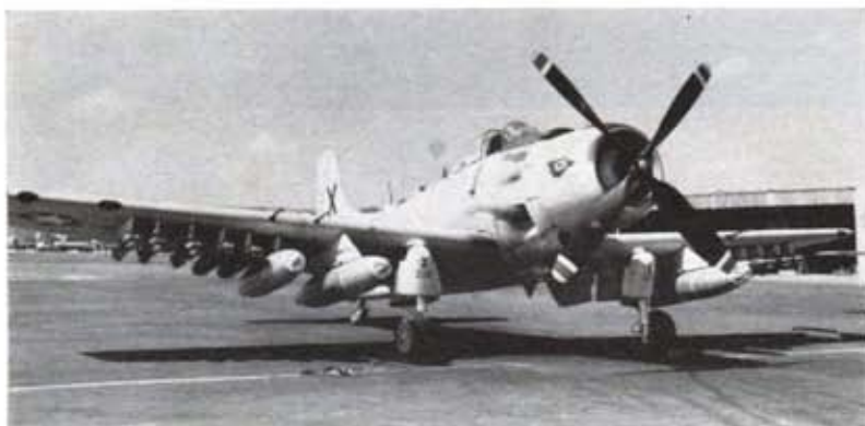
Navy A-1H employed by a second Vietnamese fighter squadron, the 514th FS, carries load of frag bombs and rockets along with .50-caliber machine guns.