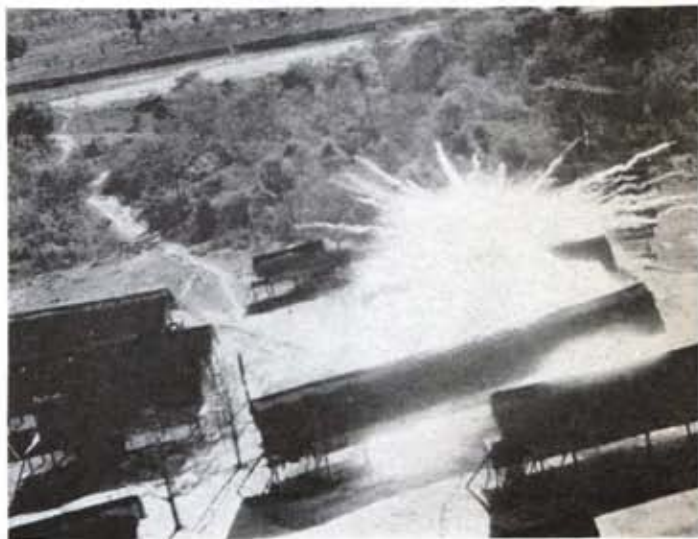
Napalm from a Vietnamese T-28 hits dead center in the longhouse barracks of Communist guerrilla forces. Besides destroying the encampment, Vietnamese pilots raked the surrounding area with bullets and rockets.

South Vietnam's Flying Tigers, trained in US pilot schools and assisted by USAF advisers, are becoming expert in these unusual techniques. In turn, US Air Commandos are gaining vital combat experience in their mission of training free-world forces to prevent or win guerrilla war.