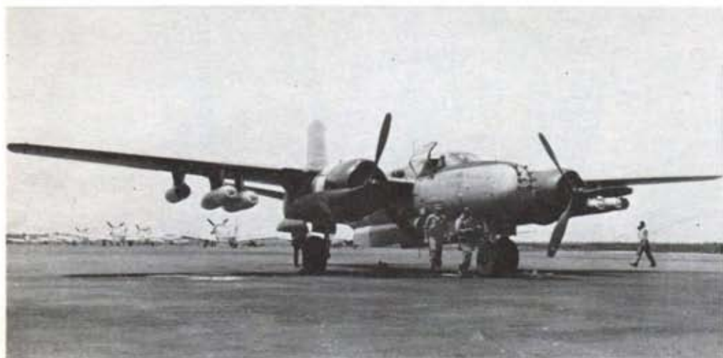
Heavily armed B-26s in Vietnam carry more armament under wings than B-17s carried internally in WW II, plus fourteen .50-caliber guns. Weapon mix includes 2.75-inch rocket pods, fragmentation and general purpose bombs, and flares. They also carry reconnaissance cameras.