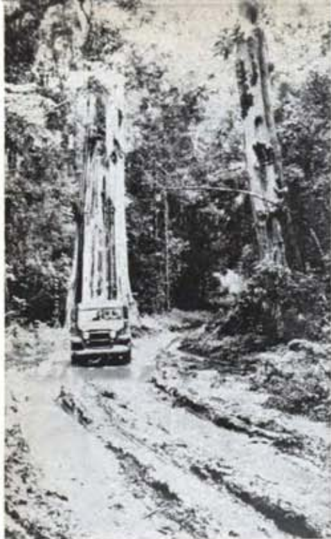
Both the importance and difficulties of air operations in Vietnam are shown here. Muddy trails and dense jungles hamper overland pursuit of guerrillas, but jungle growth obscures enemy moves from the air.