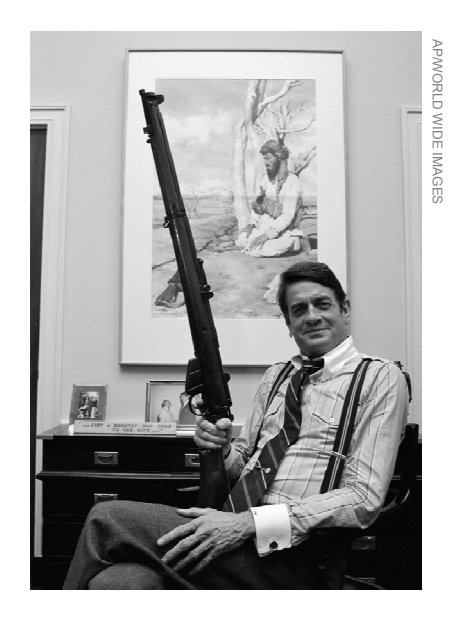
It should not take the unorthodox methods of Charlie Wilson to make Congress a positive force for our national security.

Today there are literally dozens of committees that share re-