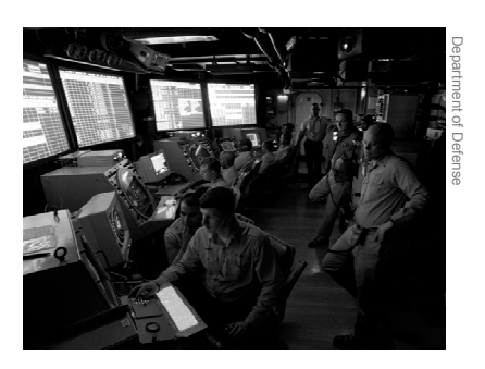
The U.S. military, like all of us, is more and more dependent on computers.

minds in hardware and software to the uniformed services? Many of these students have tattoos and body piercing. They resist strict hierarchical organizations like the military. Military contractors are able to hire some of them in order to interface with active duty troops without violating military culture.