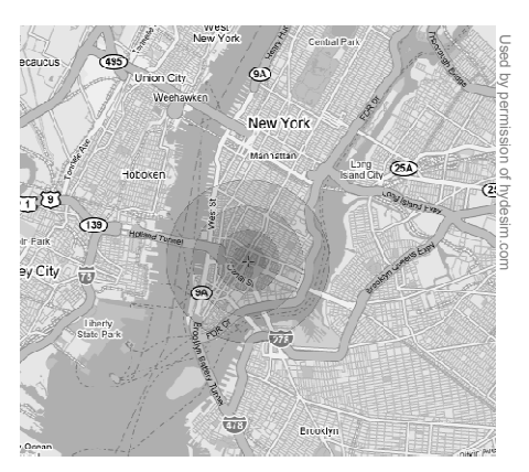
The area that would suffer damage from just the blast effects of a 10 Kt nuclear bomb detonated in the heart of New York City.

consolidates under a single unified command existing missions that were previously executed by other DOD organizations. This provides unity of command, which is critical to mission accomplishment." But does asserting our efforts are unified really coordinate all the parts necessary to succeed?