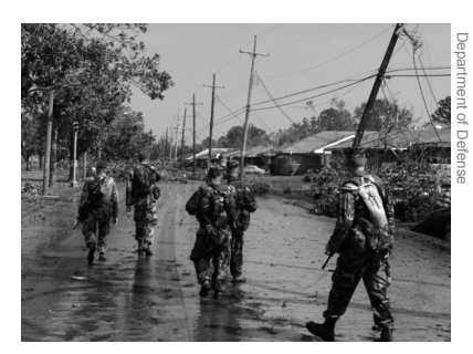
On patrol in Iraq and New Orleans: Two missions of the National Guard

all personnel but also provide an opportunity to support stateside only missions. The development of these stateside only missions would be at the discretion of the National Guard.