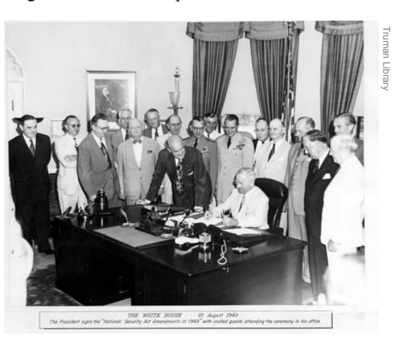
Post World War II reform; President Truman signing the 1947 National Security Act.

World War II, President Roosevelt's perceived favoritism to the