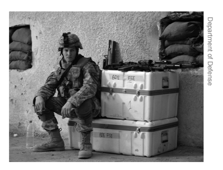
The Defense budget is still growing but without better focus it won't ever be enough to do everything.

There are possible solutions out there. Here we will sketch out four proposed approaches that