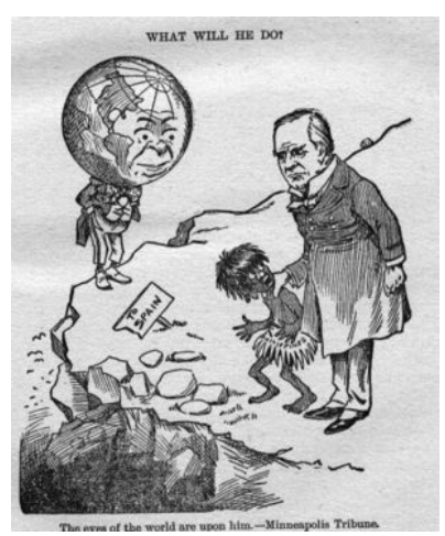
A cartoon from 1898 showing President McKinley deciding what to do with the Philippines—depicted as a savage in need of nationbuilding.

Since our military has usually been given the task, maybe it should be the Defense Department. It certainly has the re-