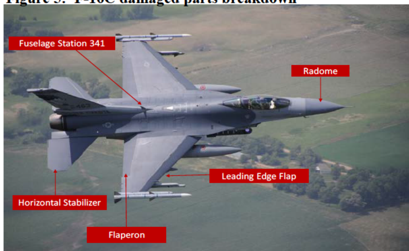
Figure 5: F-16C damaged parts breakdown

MA1 received damage during the midair collision to its right leading edge flap, the right outboard wing, the outboard flaperon, and the right horizontal stabilizer (Tab J-37). MA1 upon impact broke into two sections near the Fuselage Station 341 just forward of the installed engine (Tab J-7). Post impact analysis deemed MA1 a total loss (Tabs J-5 and P-4).