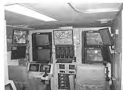
Figure 1. Inside the GCS

The basic crew for the Predator is a rated pilot to control the aircraft and command the mission, and an enlisted aircrew member to operate sensors and weapons as well as a mission coordinator, when required (Tab CC-20). The crew employs the aircraft from inside the ground control station (GCS) via a line-of-sight data link or a satellite data link for beyond line-of-sight operations (Tab CC-20).