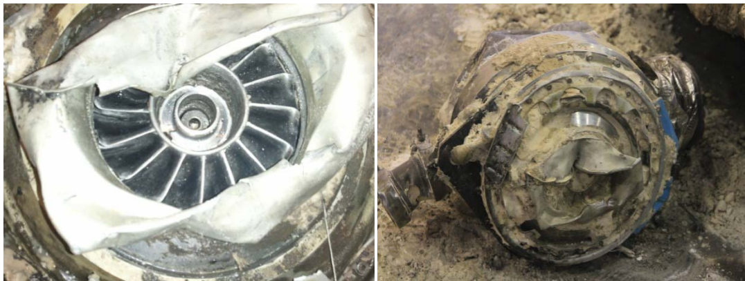
Figure 11. APU Turbine w/dirt removed (Left) and Remains of the APU (Right)

The APU (See Figure 11) was severely damaged by crash forces. The MP testified that the APU gauges indicated it was fully powered when turned on during the mishap flight. (Tab V-1.5 to V-1.6). In addition, an aerospace engineer from the Ogden Air Logistics Center reviewed the MP's testimony, photos of the mishap APU and the technical evaluations of the MA engines conducted during the Safety Investigation Board and the AIB. The aerospace engineer certified that the APU was fully functional at the time of the mishap (Tab DD-3).