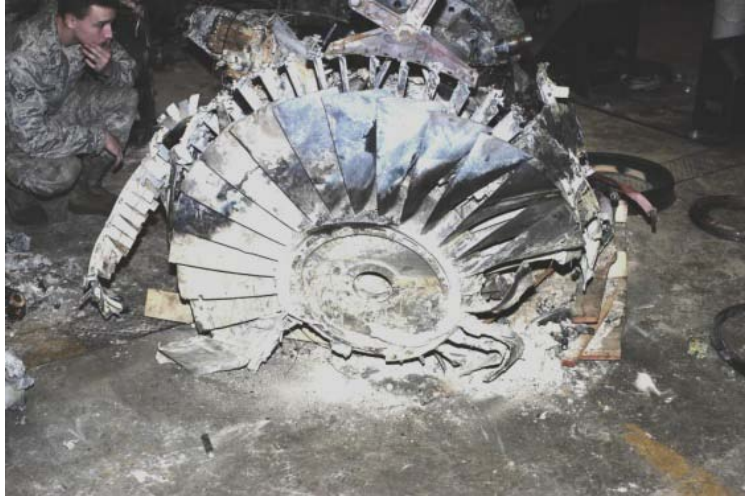
Figure 7. Engine #2

Engine #2 ( See Figure 7) suffered extensive damage in the crash, but was not exposed to temperatures as high as Engine #1. All iron components were oxidized. While some composite portions of the fan case were destroyed in the post-crash fire, some portions were intact. From behind the engine looking forward, the fan blades in the 5 to 7 O'clock positions were broken at the platform or below, while the fan blades in the 3 to 5 O'clock position had buckled. The front frame received significant damage; however, it was not melted (Tab DD-12 to DD-13).