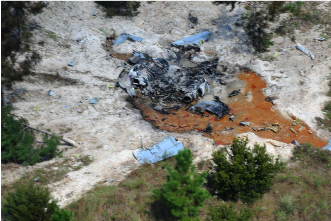
Figure 1. MA at Crash Site

The MA impacted the terrain (See Figure 1) at approximately 1448L about 20 miles northwest of Moody AFB (Tab B-3). The MA was in a clean unarmed configuration for the FCF profile. The impact location was a sandy swamp area, sparsely covered by pine trees (Tab S-5 to S-6).