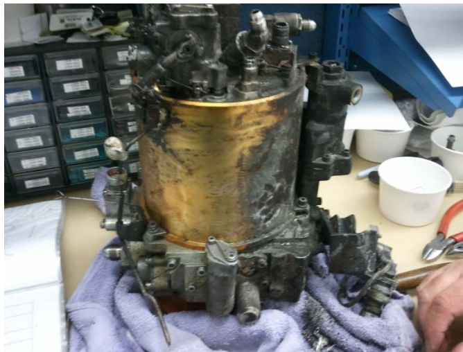
Figure 9. Engine #2 MFC

The starter gear assembly is bent but no torsional shear is noted. The MFC (See Figure 9) was taken to the fuel control overhaul facility at Fleet Reserve Center Southeast at Jacksonville Naval Air Station for disassembly and analysis. A analysis of the MFC depicts that there was a core speed of 36-37%, but this data neither conclusively supports nor disproves whether the engine was actually running (Tab DD-5, DD-16 and DD-19).