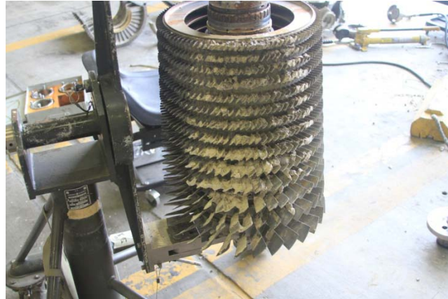
Figure 8. Engine #2 Compressor

Most compressor blades (See Figure 8) had stains due to mud and water, but the physical evidence shows no significant blade damage (Tab DD-16).