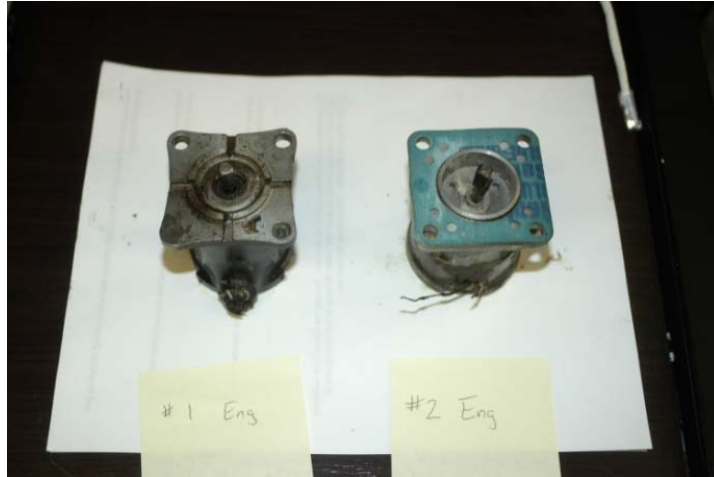
Figure 5. Tachometer Generators

The Tachometer Generator (See Figure 5) had impact damage to its case. However, the shaft was intact and it rotated freely (Tab DD-11).