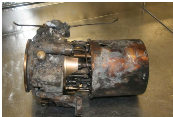
Figure 4. Engine #1 MFC

The accessory gear box fractured in multiple locations with only the Integrated Drive Generator still attached. The starter gear assembly was bent, but no torsional shear was indicated (Tab J-6). The Main Fuel Control (MFC) (See Figure 4) was taken to the fuel control overhaul facility at Fleet Reserve Center Southeast at Jacksonville Naval Air Station, Florida for disassembly and analysis. A analysis of the MFC depicts that there was a core speed of 20-21%, but this data neither conclusively supports nor disproves whether the engine was actually running (Tab DD-5, DD-11 and DD-19).