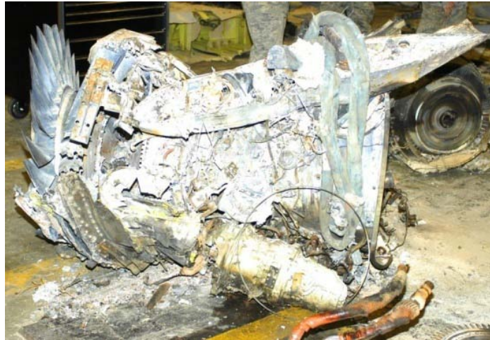
Figure 2. Engine #1

All iron components of Engine #1 (See Figure 2) were oxidized due to the heat from the fire and subsequent water immersion (Tab DD-5). The damage to the spinner, compressed against the front of the fan disc, indicates that the engine impacted the ground nose first, exposing portions of the engine to pooling of molten aluminum. From behind the engine looking forward, the fan blades in the 4 to 6 O'clock positions were broken at the platform, while the fan blades in the 6 to 8 O'clock position were buckled (Tab DD-6).