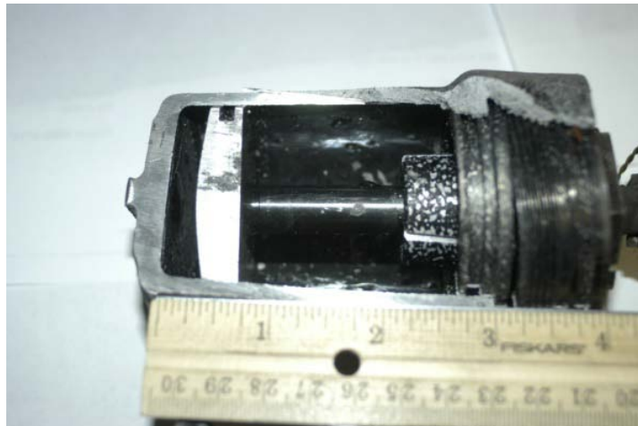
Figure 6. Engine #1 VG Actuator

One VG actuator was found for Engine #1. The TF-34 engineer disassembled the VG actuator (See Figure 6) and determined it to be closed at the time of impact, which implies that the engine core was turning at low or no RPM (Tab DD-12).