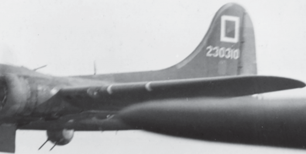
A B-17 (top photo) opens its bomb bay door as it nears the target, the U-boat pens in Turlon, France (bottom photo).

B etween October 1942 and October 1943 the US Army Air Forces' Eighth Air Force flew more than 2,000 sorties against German submarine bases at Lorient, Saint-Nazaire, and Brest, in France, and against Bremen, Emden, Kiel, and Wilhelmshaven in Germany.