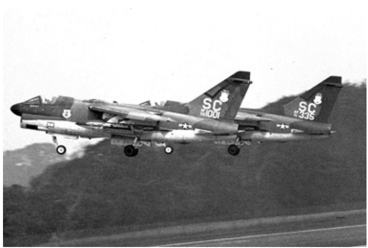
A-7s left Vietnam for the Air Guard.