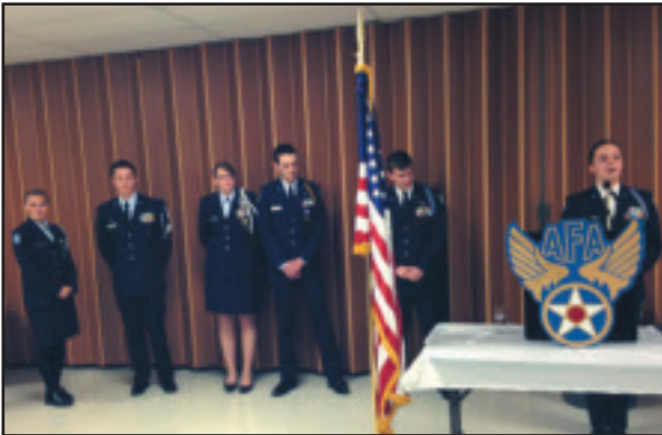
At the Harry S. Truman Chapter's fundraiser, AFJROTC cadets tell the audience what they learned at leadership camp. Through this annual dinner and silent auction, the Missouri chapter raises money to send the cadets to leadership training.

cadet in Seattle has been selected for AFA's $15,000 Michael Wilson Scholarship.