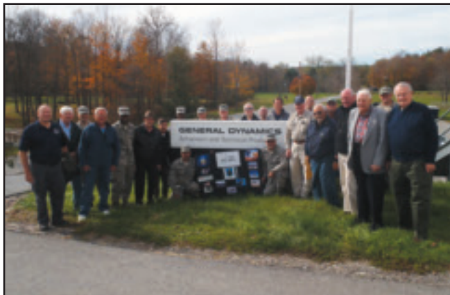
The Green Mountain Chapter visited the General Dynamics firing range at Camp Ethan Allen in Vermont and learned about the F-35's gun system.