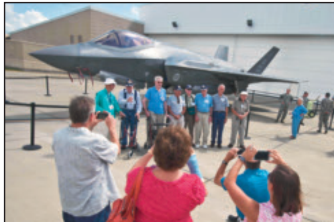
Family members snap photos of World War II P-47 pilots and maintainers standing next to an F-35.