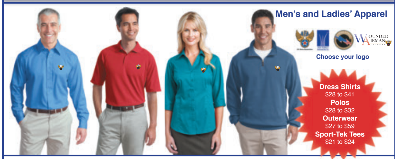
Apparel is available in a wide variety of colors and sizes with no charge for your choice of the AFA logo, the Air Force Memorial Spires, the CyberPatriot logo or AFA's Wounded Airman Program logo. Add your name or other embroidered personalization for $5 more.