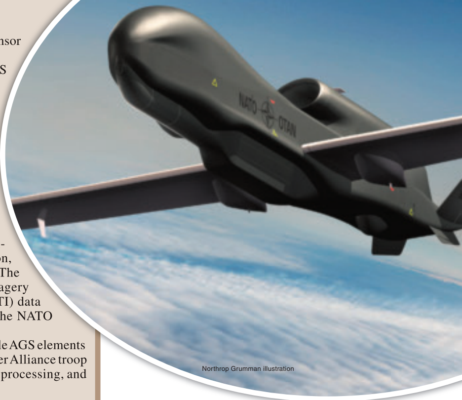
Northrop Grumman illustration

NATO intends to operate the Global Hawks in “segregated airspace,” meaning separated from civil air traffic.