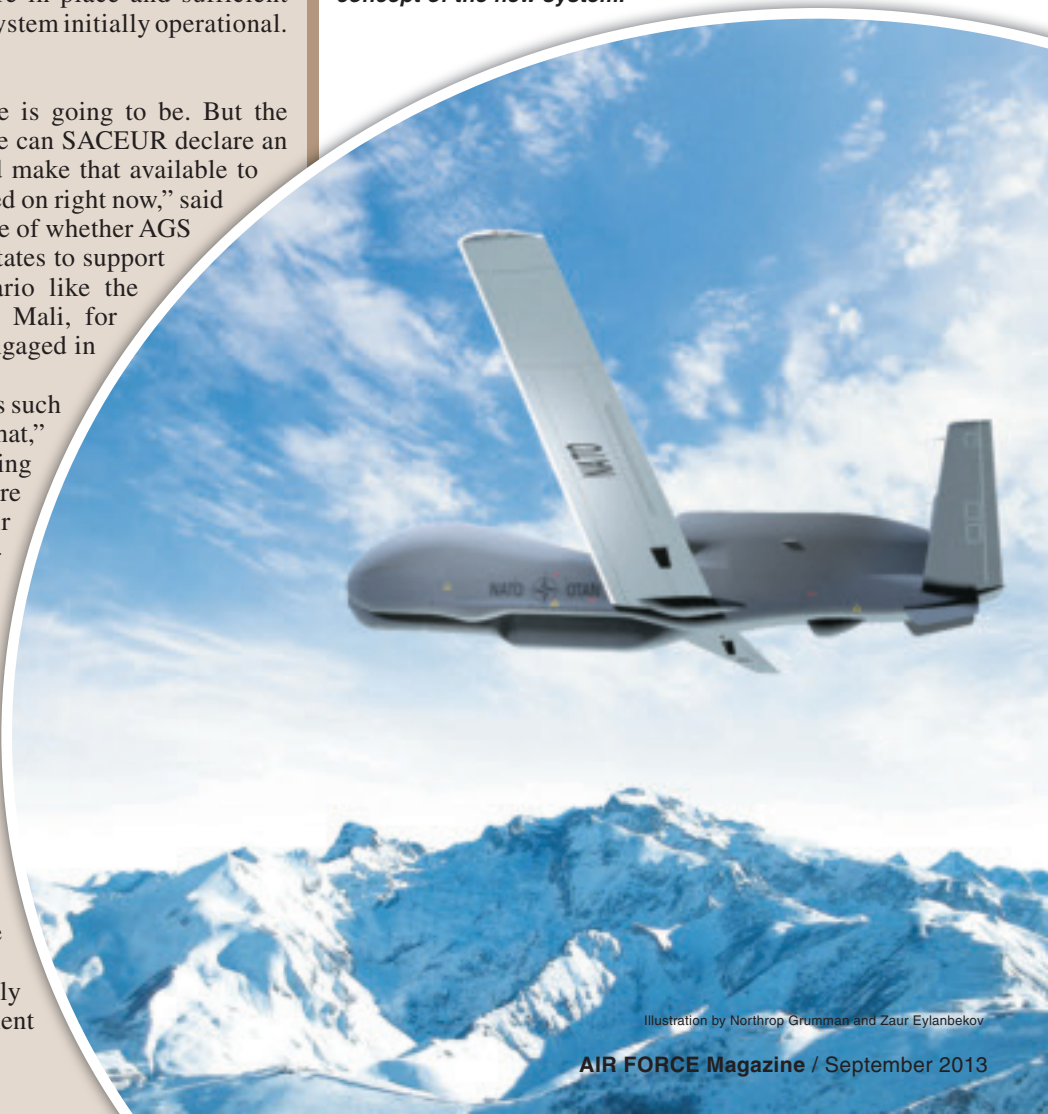
Illustration by Northrop Grumman and Zaur Eylanbekov