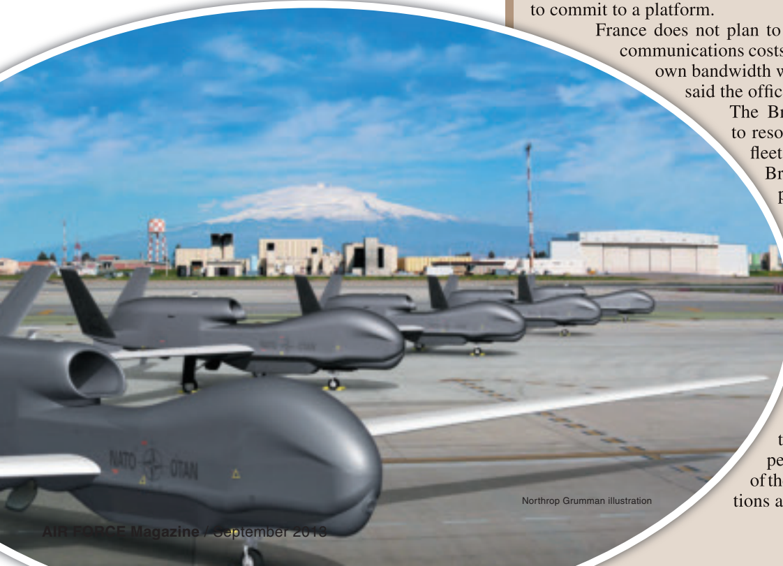
Northrop Grumman illustration

If the British and French contributions-in-kind do not materialize, then both nations are expected to provide their share of the funds to cover AGS operations and sustainment.