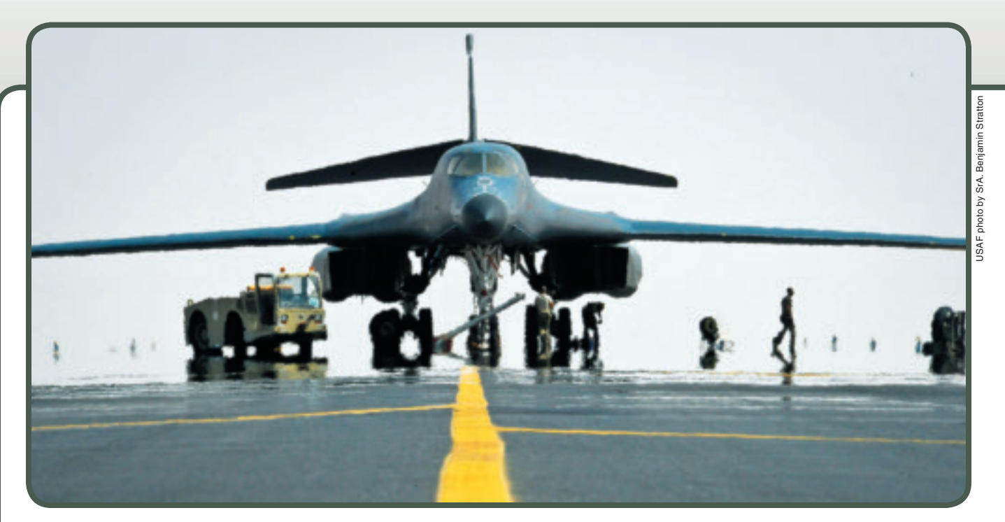
"If Syria blows up, or Iran blows up, or North Korea blows up, I don't have a bunch of excess forces I can immediately shift to that conflict. I'm going to have to pull them from other places."

The Air National Guard and the Air Force Reserve are flying nearly their full planned flying hour program because Congress allowed them the flexibility to reprogram funds within the overall budget reduction. The Total Force units took money out of base operating support and depot maintenance in order to keep flying, according to a Guard Bureau spokeswoman.